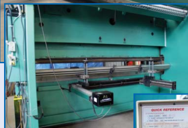
View Of Autogauge Back Gauge