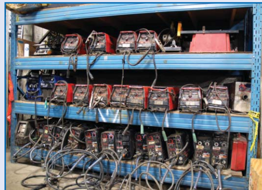
Partial View Of Welders

(2) MILLER Invision 352 MPA Welders C/W Miller XR Aluma-Feed Wire Feeders, S/N's MA150820A & MA150816A