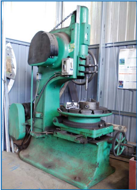
WM MUIR & CO No. 165 Vertical Slotter With 24" Rotary Table, S/N 165