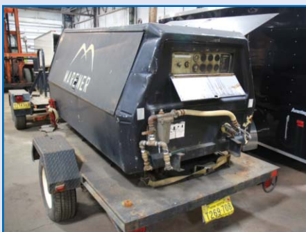
INGERSOL RAND Portable Air Compressor, Diesel Engine, 2598 Hrs Mounted On 5' X 6' T/A Trailer