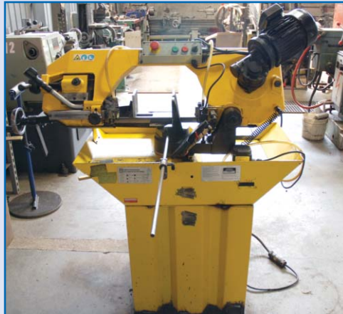
POWER FIST Model 8045518, 9" Horizontal Band-Saw, S/N 0053535