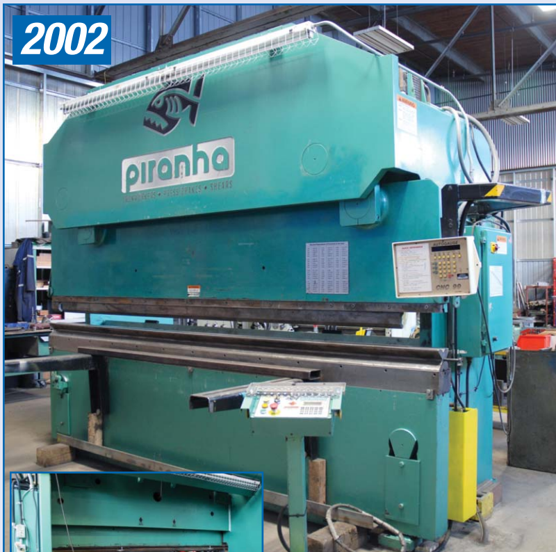
PIRANHA Model 25012, 250 Ton X 12ft CNC Hyd. Press Brake With 8" Variable Stroke, 17" Open Height, 90 IPM Approach Speed 20hp, 10'6" Between Housing, 8" Throat, Full Function Pedestal Control With Dual Palm Buttons, Automec CNC 99 2 Axis Cnc Back Gauge, (2) 36" Support Arms, 12ft 4 Way Die And Various Press Brake Dies, 37 000 Lbs, S/N 1011