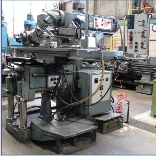
CORREA Fu-125 / Cm 100 Universal Mill With Dividing Head, 16" X 63" Table, Power Feed, Power Head Stock, Divisor Device, 1700 Vertical RPM, 1,400 Horizontal RPM S/N 1450424