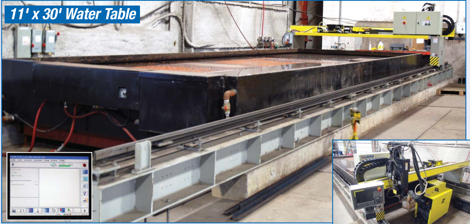
ESAB Shadow Dx-4000 Gantry Type Plasma Cutting System With Precision Plasmart 360 Power Source, CC-11 Coolant Circulator, Up To 2" Cutting Capacity, Note: Low Hours S/N 0560947520