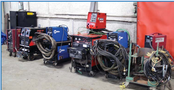
Partial View Of Welders