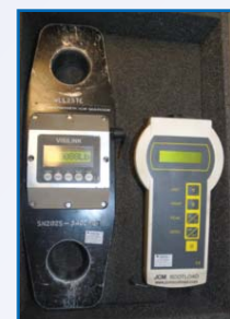
SCOTLOAD VISILINK Load Cell, Land And Offshore Calibrated S/N 2025-340dh3