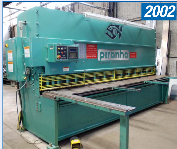
PIRANHA Model TC3/8-12, 3/8" x 12ft Hydraulic Shear With CNC Full Programmable Back Gaugefront, 24 SPM, 15 Holddowns, 20 HP, 24 500 Lbs, 49" Squaring Arm, (3) 24" Support Arms, S/N T3/8-12-1002