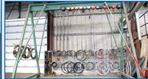
Portable Gantry And Hoists

(3) LINCOLN Model K2271-1, Vantage 500 Diesel Welders, S/N's U1030806148, U1040400182 & U1030511069.