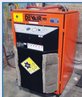
DEVAIR Model D-VAVC-5000-5, 15HP Air Compressor, 4,587 Hrs, S/N 36044-TE