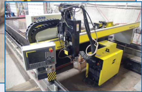
View Of ESAB Controls, Cutting Head And Power Source