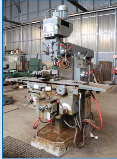
CORREA F2UA Universal Mill With 12" X 48" Table, 3,150 Vertical RPM, 1,800 Horizontal RPM S/N 5101722