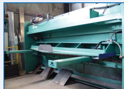
View Of Shear Back Gauge