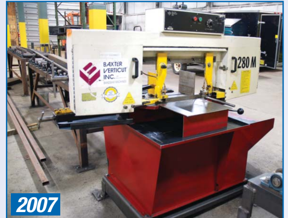
BAXTER 280M Horizontal Band-Saw With Clamping S/N 5738