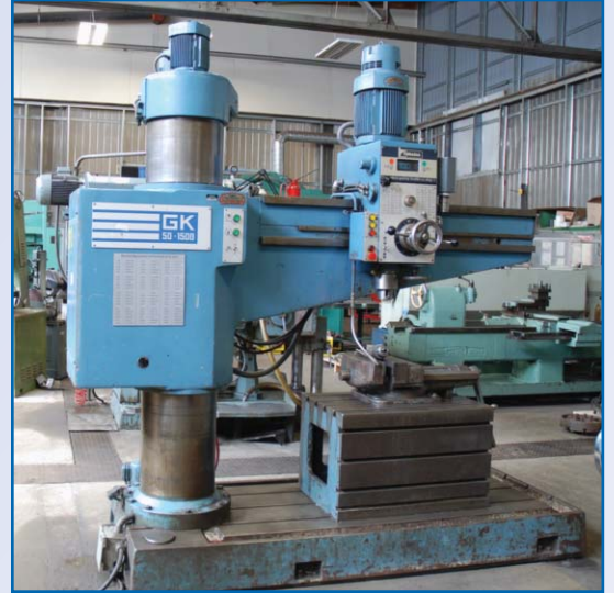
FORADIA Gk 50-1500 Radial Arm Drill With 32" X 19" X 19" Box Table, 1,400 RPM, 4ft Arm Travel, S/N 540432-ID