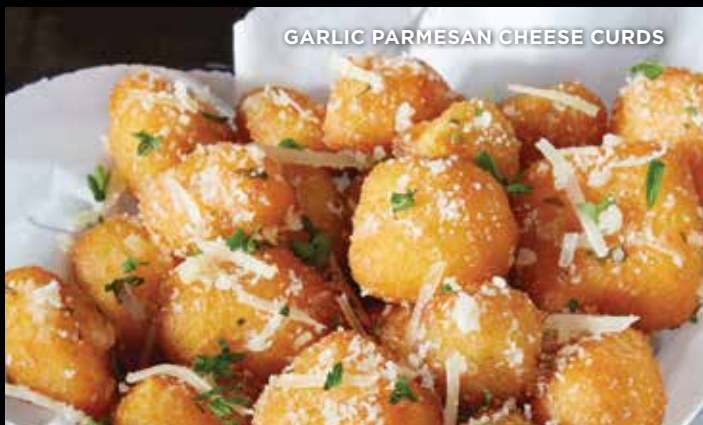
GARLIC PARMESAN CHEESE CURDS

Served with rustic marinara sauce. 9.49 1287 CALS.