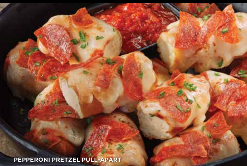
PEPPERONI PRETZEL PULL-APART