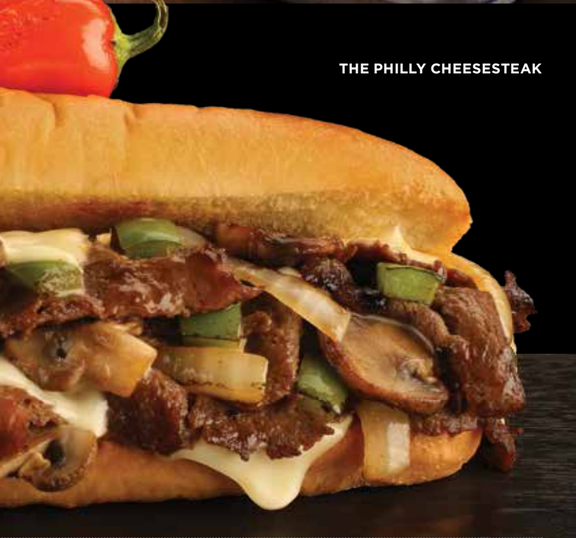
THE PHILLY CHEESESTEAK