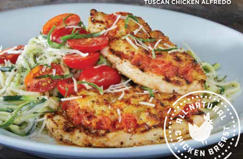
TUSCAN CHICKEN ALFREDO