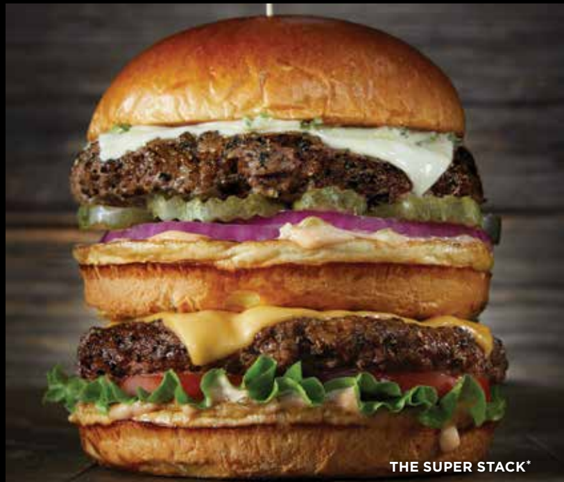
THE SUPER STACK*

Lettuce, tomato, onions and pickles. 10.99 1164 CALS. Add applewood smoked bacon 1.39 90 CALS.