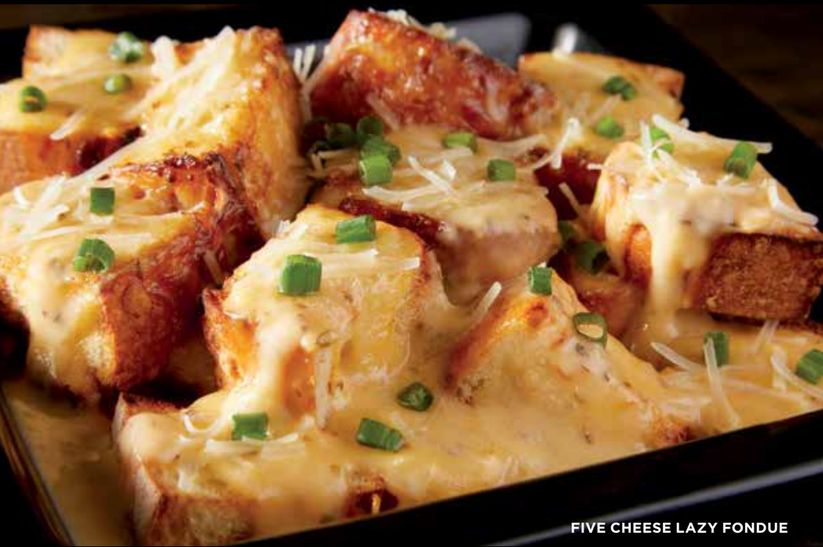
FIVE CHEESE LAZY FONDUE