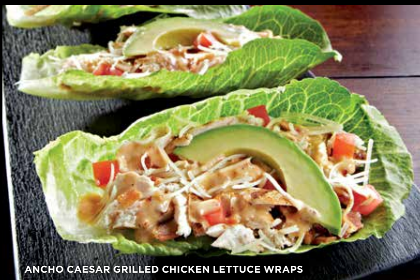
ANCHO CAESAR GRILLED CHICKEN LETTUCE WRAPS