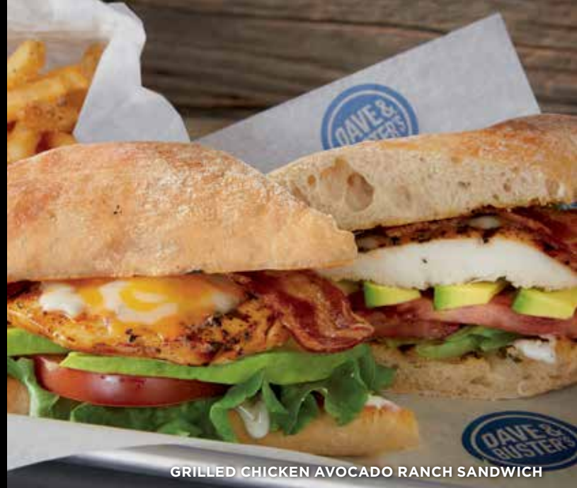
GRILLED CHICKEN AVOCADO RANCH SANDWICH

NEW! Parmesan Bacon Brussels Sprouts X.XX 424 CALS.