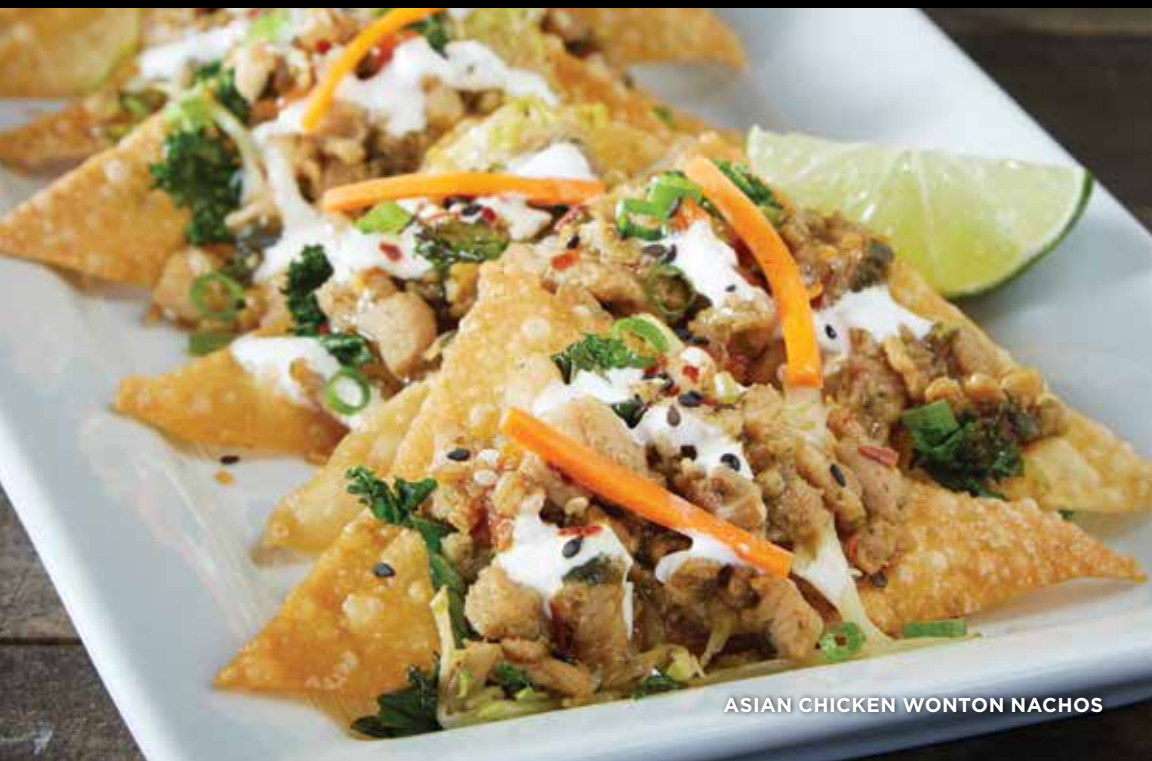
ASIAN CHICKEN WONTON NACHOS