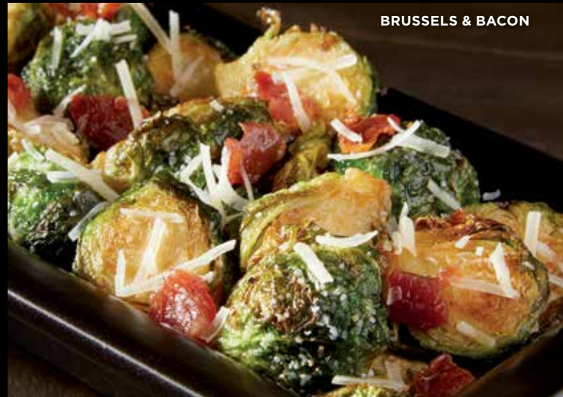
BRUSSELS & BACON

AS A PROUD PARTNER OF MAKE-A-WISH® SINCE 2012, DAVE & BUSTER'S HAS RAISED OVER $10 MILLION TO HELP GRANT THE WISHES OF CHILDREN WITH CRITICAL ILLNESSES THROUGH A VARIETY OF FUNDRAISING INITIATIVES. FOR MORE INFORMATION, VISIT WISH.ORG .