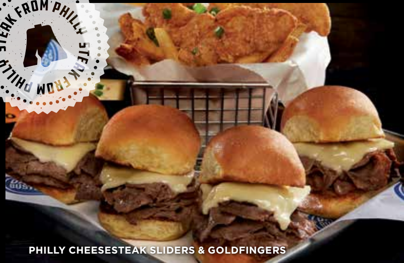
PHILLY CHEESESTEAK SLIDERS & GOLDFINGERS