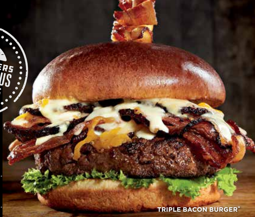
TRIPLE BACON BURGER*