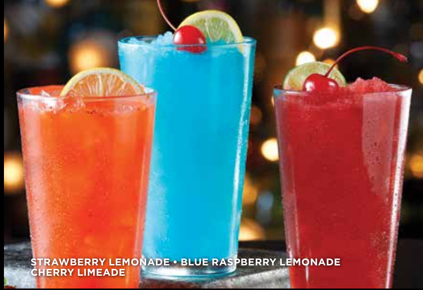
STRAWBERRY LEMONADE • BLUE RASPBERRY LEMONADE CHERRY LIMEADE

ENJOY FREE REFILLS ON ALL OF OUR FOUNTAIN DRINKS, TEAS & COFFEE