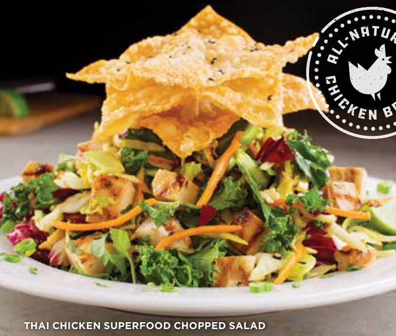
THAI CHICKEN SUPERFOOD CHOPPED SALAD

House-marinated grilled steak, spring mix, grape tomatoes, crumbled bleu cheese, candied pecans and Balsamic Herb Vinaigrette with crispy frazzled onions. 12.99 595 CALS.