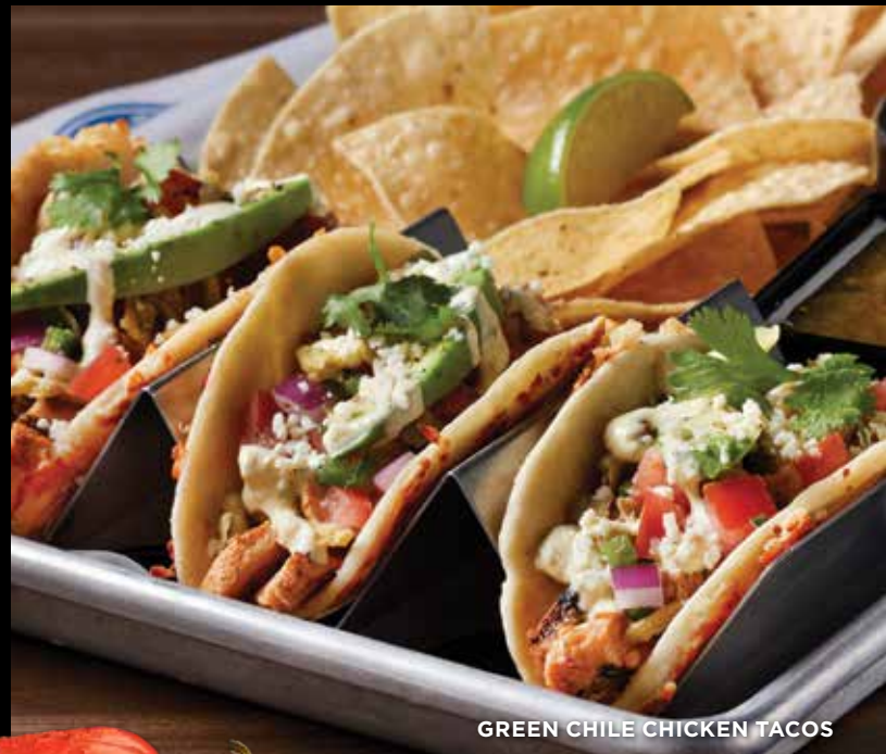
GREEN CHILE CHICKEN TACOS