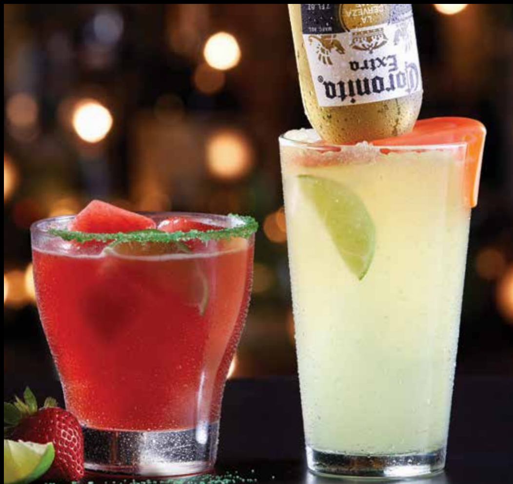
STRAWBERRY WATERMELON MARGARITA • ORIGINAL CORONARITA™

Sauza Silver Tequila, Cointreau, strawberry and mango purees. 207 CALS.