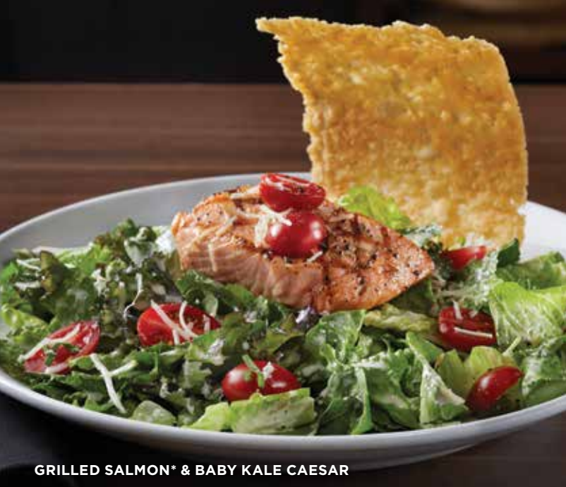
GRILLED SALMON* & BABY KALE CAESAR