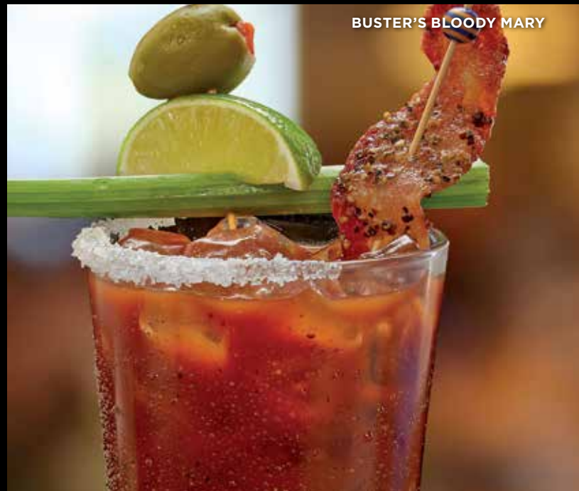
BUSTER'S BLOODY MARY