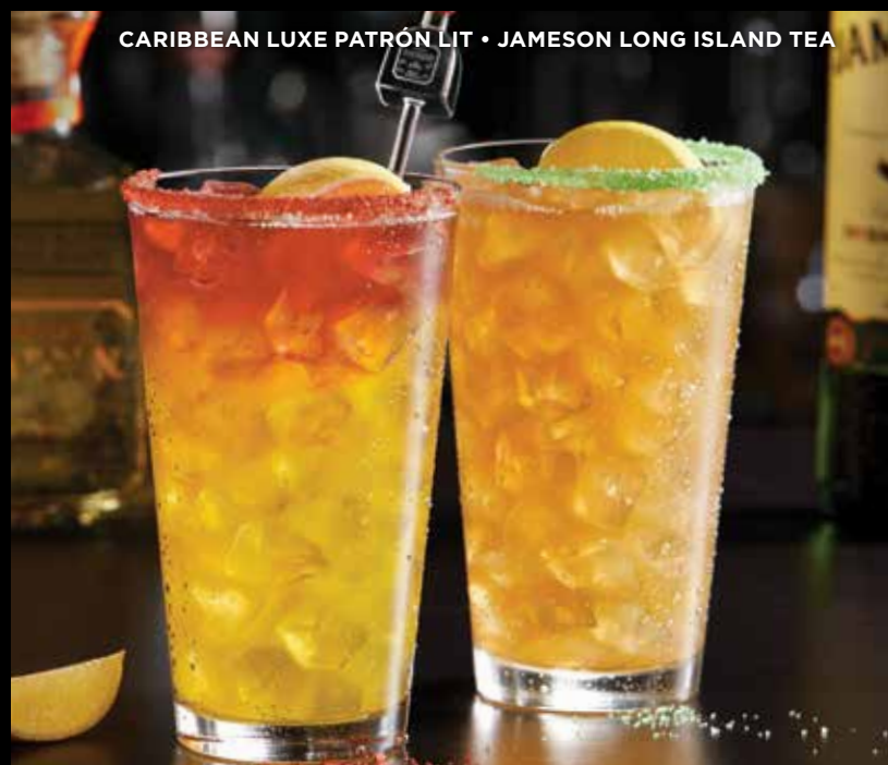
CARIBBEAN LUXE PATRÓN LIT • JAMESON LONG ISLAND TEA