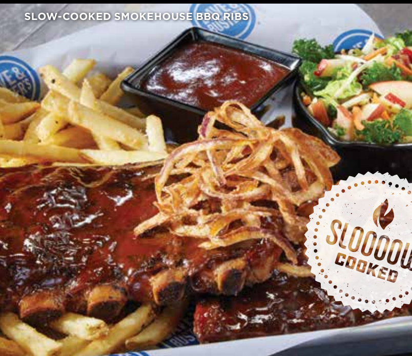
SLOW-COOKED SMOKEHOUSE BBQ RIBS

House-marinated 5 oz. steak and grilled shrimp wrapped with applewood smoked bacon with garlic mashed potatoes, garlic green bean medley and creamy lobster sauce. 18.49 1007 CALS.