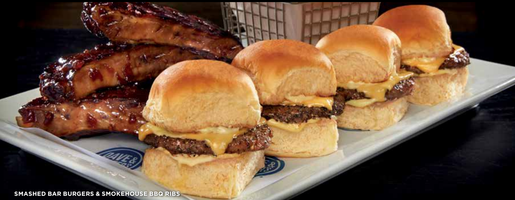
SMASHED BAR BURGERS & SMOKEHOUSE BBQ RIBS

*NOTICE: COOKED TO ORDER. CONSUMING RAW OR UNDERCOOKED MEATS, POULTRY, FISH/SHELLFISH OR EGGS MAY INCREASE YOUR RISK OF FOODBORNE ILLNESS, ESPECIALLY IF YOU HAVE CERTAIN MEDICAL CONDITIONS. BEFORE PLACING YOUR ORDER, PLEASE INFORM YOUR SERVER IF A PERSON IN YOUR PARTY HAS A FOOD ALLERGY.