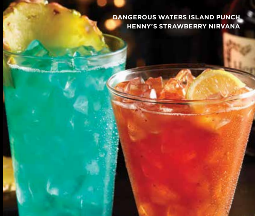
DANGEROUS WATERS ISLAND PUNCH HENNY'S STRAWBERRY NIRVANA