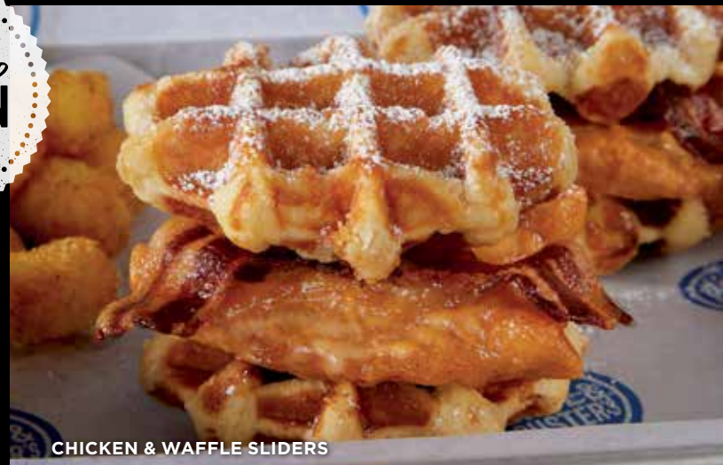
CHICKEN & WAFFLE SLIDERS