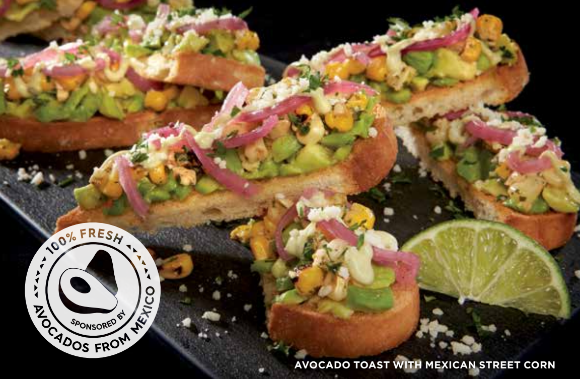
AVOCADO TOAST WITH MEXICAN STREET CORN