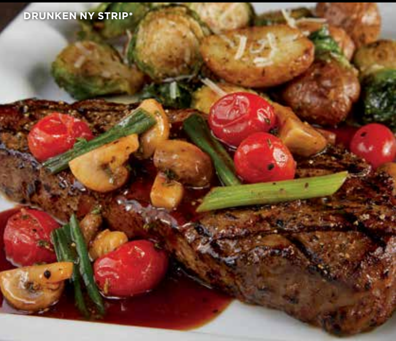
DRUNKEN NY STRIP*

Fire-grilled, house-marinated 8 oz. sirloin steak topped with crispy frazzled onions and served with loaded garlic mashed potatoes and fresh seasonal vegetables. 17.99 717 CALS.