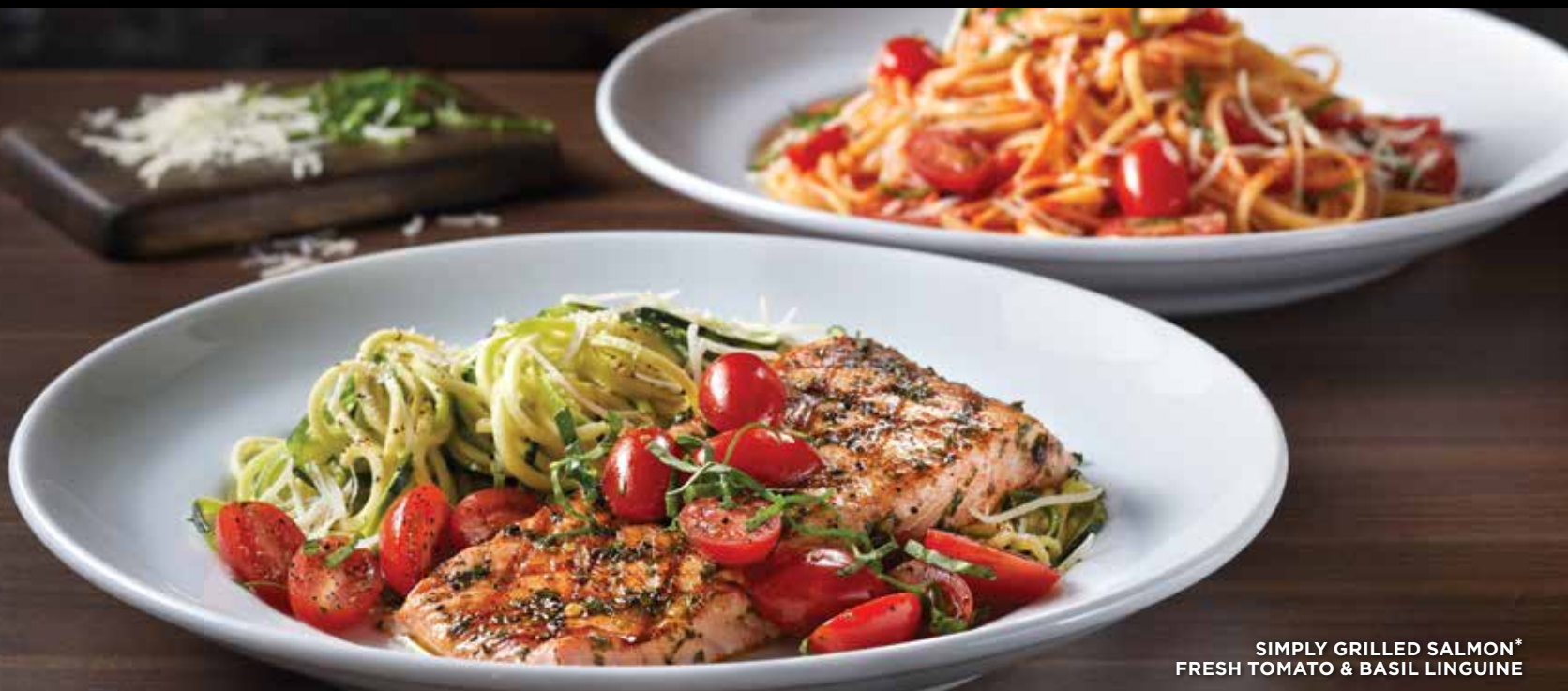
SIMPLY GRILLED SALMON* FRESH TOMATO & BASIL LINGUINE

Center-cut Atlantic salmon grilled with Louisiana spices and peppercorn garlic butter. Served with garlic green bean medley and jasmine rice. 16.99 886 CALS.