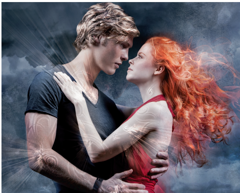
Illustration © Cliff Nielsen