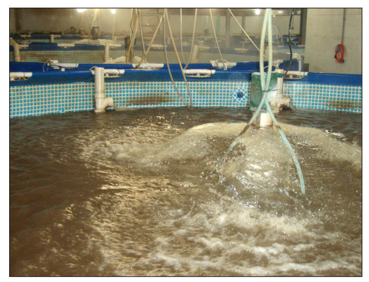
In this shrimp tank the airlifts along the side and aerator in the middle mix biofloc throughout the water column.

Increasing the heterotrophic bacteria population also increases the total oxygen demand of the tank. Heterotrophic bacteria require oxygen for life processes such as ammonia assimilation. Additionally, solids in the water column reduce the ability of that water to hold as much oxygen. Oxygen must be added either through aeration with atmospheric air and perhaps supplemental compressed or liquid oxygen. Popular aeration devices include airlifts, air diffuser stones, venturi aspirators, and water pumps. Supplemental oxygen can be incorporated into venturi aspirators or diffuser stones.