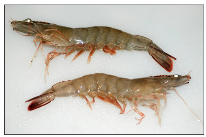
Marine white leg shrimp (Litopenaeus vannamei) from a biofloc system.

Only a portion of the alkalinity tied to heterotrophic bacteria can be recaptured by anaerobic decomposition. Alkalinity must be supplemented by additions of sodium bicarbonate. Alkalinity should be maintained above 150 mg/l and measured at least twice per week. Alkalinity helps maintain pH above 7.0, so if daily pH readings fall below desired levels a quick check of alkalinity and additions of sodium bicarbonate are warranted. As a guide, it is expected that 0.25 kg of sodium bicarbonate would be added for every kilogram of feed entering the system. Researcher Tzachi Samocha has created a good guide for additions of sodium bicarbonate, soda ash, and sodium hydroxide to control alkalinity and pH. As with carbohydrate additions, sodium bicarbonate should be mixed with water and added to the rearing system gradually for efficient uptake.