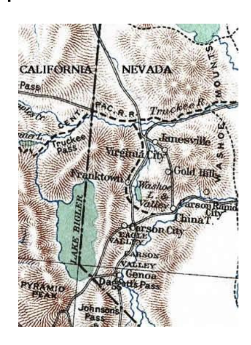
Map of Nevada in 1860s from the Dave Thomson collection.