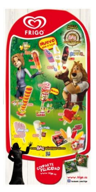
Kids Price Board