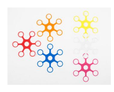
Appendix 8: Pieces to create bracelets and necklaces

The game consists on putting several gogos in a line on the floor. The player or players will use another gogo to throw it and make the rest fall.