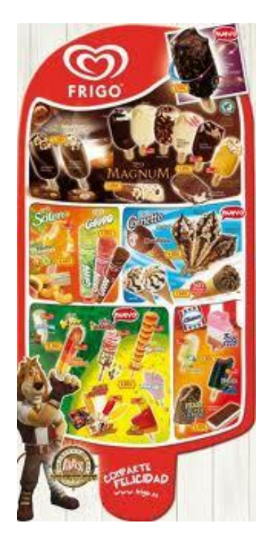
General Price Board