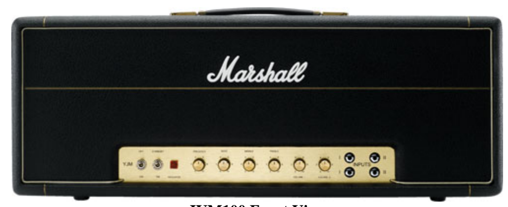
JYM100 Front View

December, 2010 - Marshall Amplification is proud to present the Signature YJM100: a 100-watt, valve head that was developed in close conjunction with the legendary Swedish six-string shredder, Yngwie Malmsteen. The YJM offers the perfect balance of vintage tone and looks (see PHOTO 1: JYM100 Front View), alongside modern features (see PHOTO 2: JYM100 Rear View) which makes the amplifier the perfect players' tool for "plug in and play" recording or live performance.