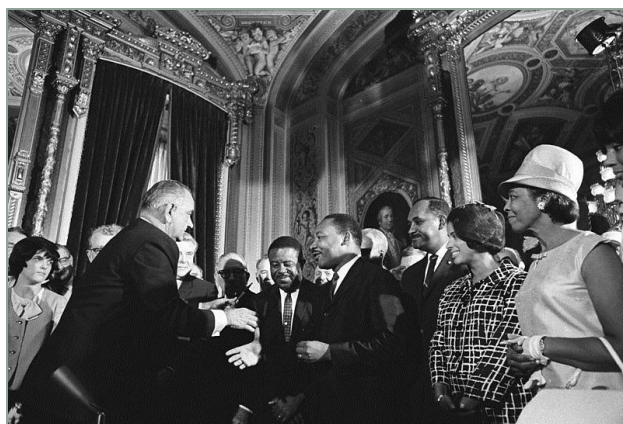
President Johnson and Martin Luther King, Jr. at the signing of the Voting Rights Act on August 6, 1965.

He—and we—did overcome. On August 6, 1965, President Johnson signed into law the Voting Rights Act, hailed by many as the most effective civil rights law ever.