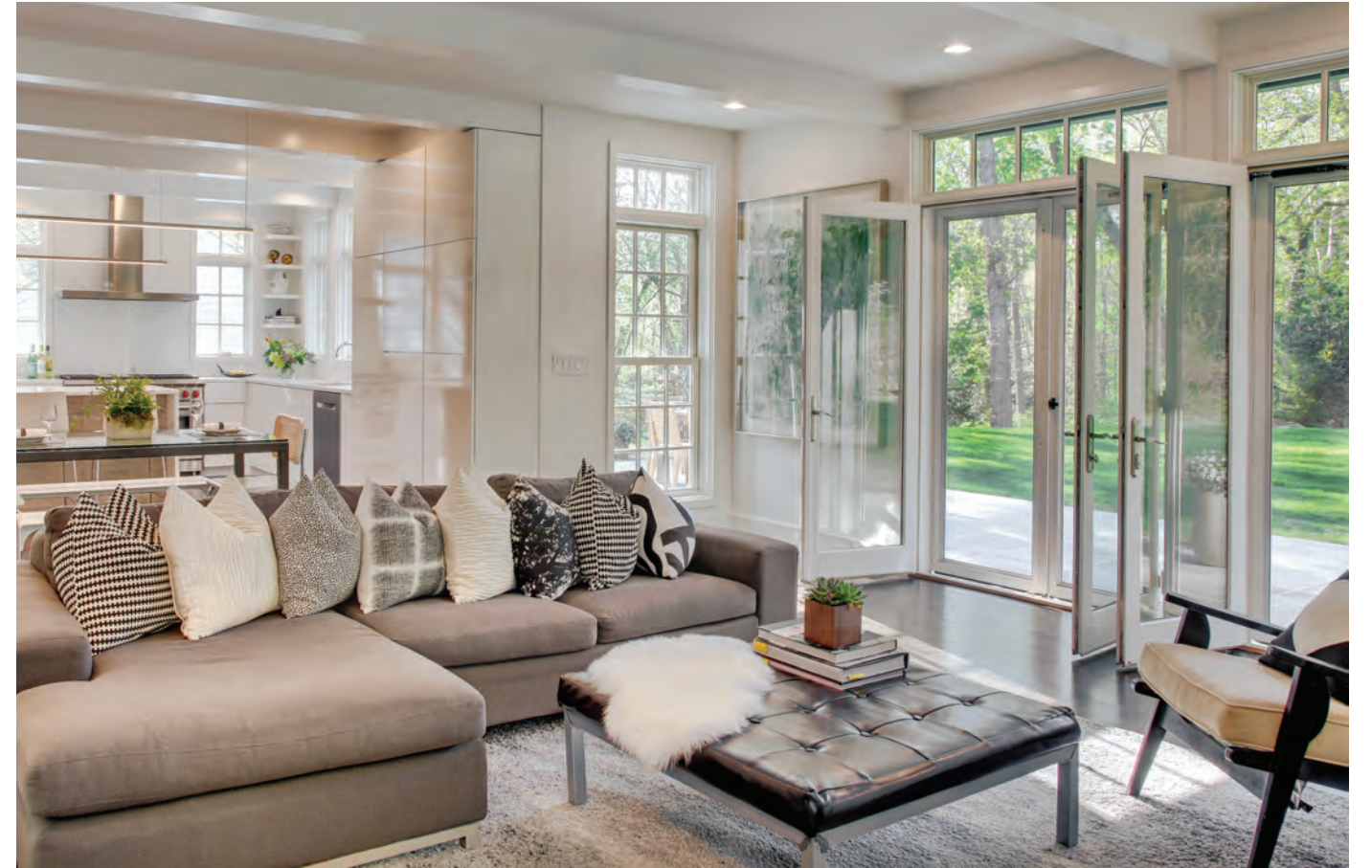
INTEGRITY WOOD-ULTREX INSWING FRENCH DOORS