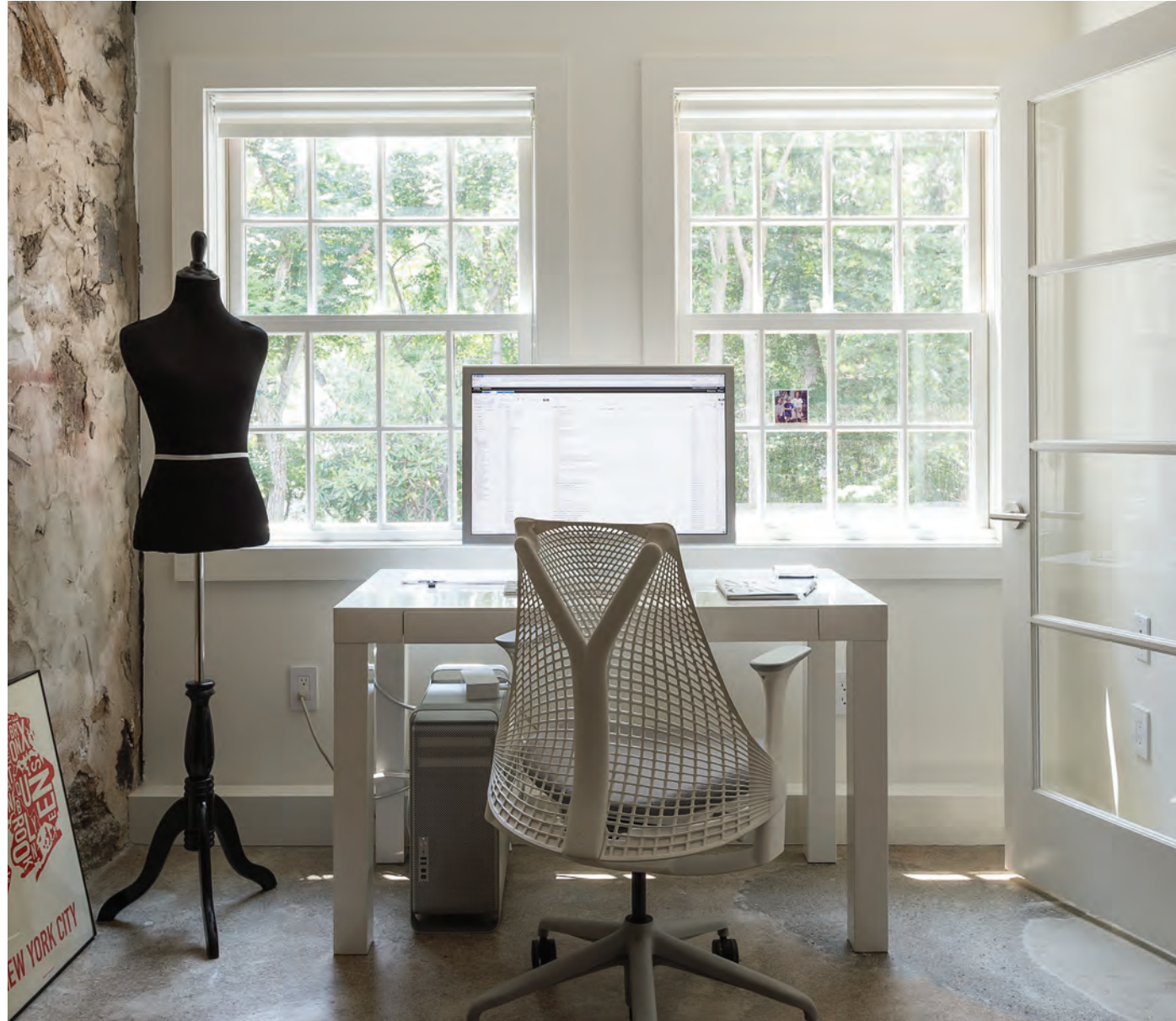
INTEGRITY WOOD-ULTREX CASEMENT AND DOUBLE HUNG WINDOWS