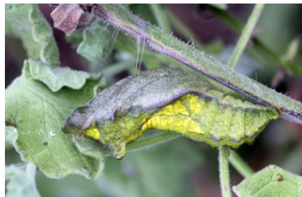
Chrysalis of the pipevine swallowtail butterfly ( Battus philenor )

We were able to find the tiny eggs deposited by butterflies. Some of the children watched as the newly hatched caterpillar turned and ate the egg shell from which it came.