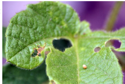
Egg of the gulf fritillary ( Agraulis vanilla )

ing out with the day camps. There are no better teachers than 5 to 9 year olds when it comes to teaching the all important lesson of taking a closer look.