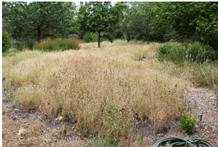
Meadow in July 2014

After a spectacular and extended splash of spring colors in the meadow, the meadow has now moved into its “scruffy” phase. While the stalks turn brown and dull and the petals shrivel and drop, the flower heads continue to do their important work of making seeds.