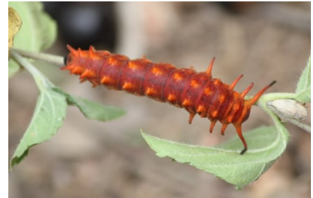
Caterpillar of the pipevine swallowtail butterfly ( Battus philenor )

Caterpillars in all 5 instars were viewed by many of the children. On one day, the children watched a pipevine swallowtail caterpillar anchor itself, preparing to go into the pupa stage; the next day another group of children were able to see the chrysalis.