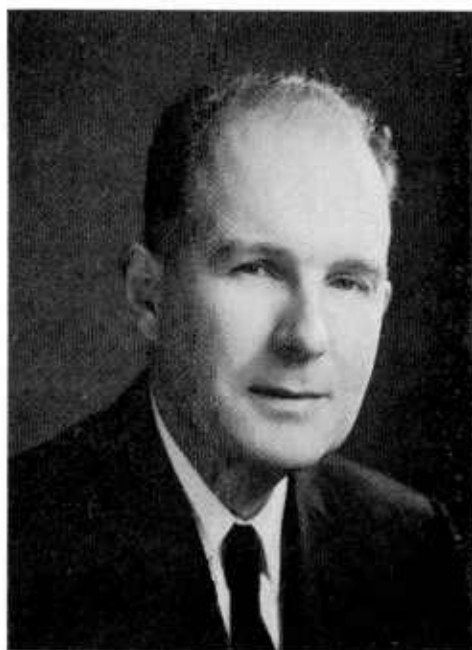
WILLIAM S. JAMES President of the Senate