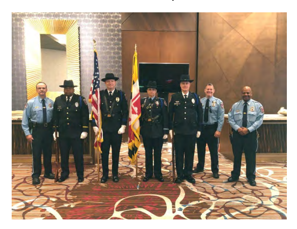
2019 Commendations to Officers and Citizens