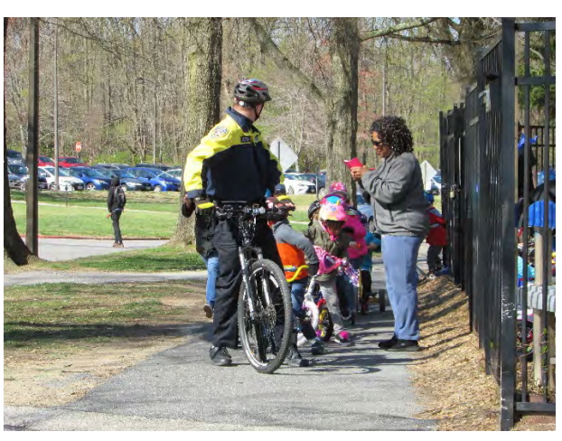
Anne Arundel Community College Department of Public Safety & Police