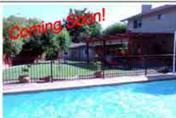
2,624 sq ft Resort Style Home with 4 bdms, 3 bath rooms, a Den and Inside Laundry. Remote control salt water pool w/ outdoor kitchen & fireplace. Hardwood floors, custom cabinets, full house sound system.