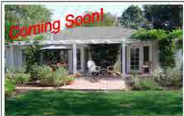
Charming River-Park home, recently remodeled, features many upgrades with 3-bdms / 1.5 bths. Hardwood floors in living rm, bedrooms, office, hallway. Updated kitchen, gas log fireplace, and a private brick garden patio, and more