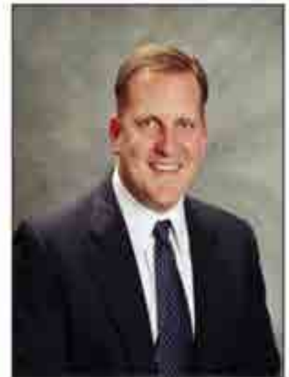
Proudly Serving River Park!

Call me for a free estimate of value on your home.