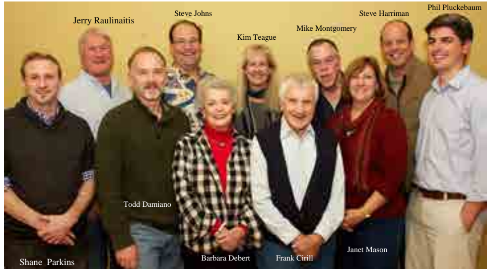
2012 RPNA Board of Directors