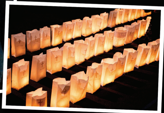
Luminarias were aglow, three bonfires burned and the sky over our Pastoral Center was illuminated with lights. Over 125 parishioners joined in song with our new, wonderful 8:30 am Mass Ensemble and lifted their hearts with intentions and prayers during our first Night of Fire and Light .