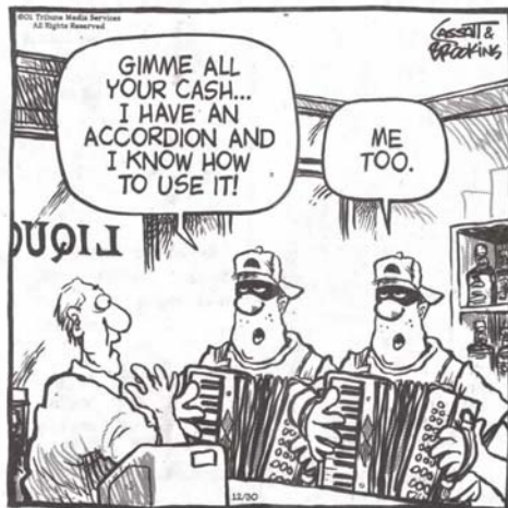
Tribune Media Service

1:00pm Magnanini Farm Winery and Restaurant, 172 Strawridge Road, Wallkill, NY Call 845-895-2767 for further details