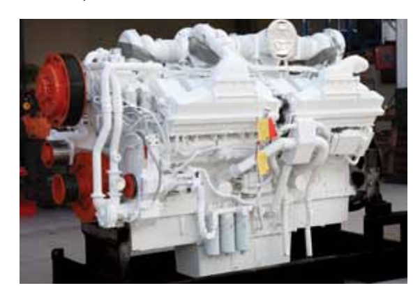
Cummins Certified Rebuilt engine.

The Atlas database is not only critical for Cummins' own planning, but it can also help customers understand and plan for their own requirements.