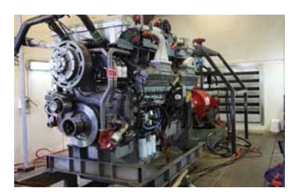
Dynamometer test facilities are capable of testing engines up to 4000 hp.

Each assembly station has a ViewEASE touch-screen computer that is linked to high horsepower assembly software from Cummins' manufacturing plants at Daventry in the UK and Seymour in the US. ViewEASE provides the operator with specific build instructions and other associated documentation related to the specific assembly process.