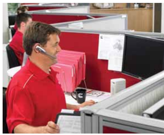
The Cummins Support Centre boasts a team of highly experienced service technicians who are based at a dedicated facility in Melbourne.

With Cummins you're not just buying an engine,