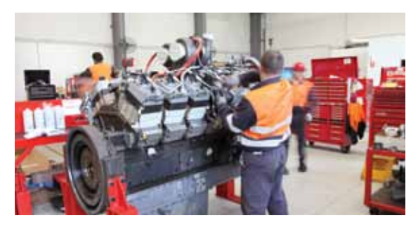
Final assembly of external components and trim.

The Master Rebuild Centres are fitted with the latest tooling to handle the manufacturing-based process, including electric rollover stands, electric tensioning tools and a CNC block machine for blueprinting, boring and surfacing.