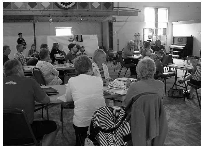
Workshop participants in Litchfield

This activity was made possible by an appropriation from the Minnesota State Legislature with money from the State's general fund, and its arts and cultural heritage fund that was created by vote of the people of Minnesota on November 4, 2008.