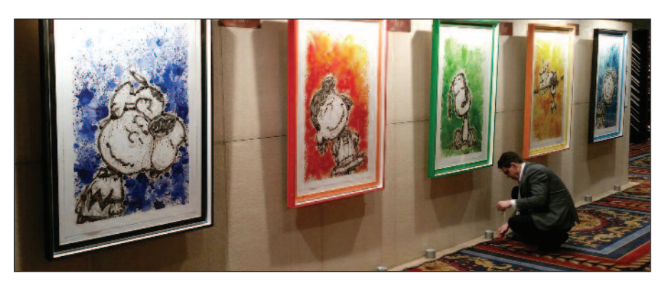
The Omega Moulding booth featured Takiya Hanging Systems at the 2015 WCAF Expo.

Newly is a system with specially designed Twister suspender rails. The Twister head fits into Click Rails, then twists down to lock, leaving the barrel inside the rail. Rails are available to support 20, 30, or 50 kg (44, 66, or 110 pounds), Twister perlon