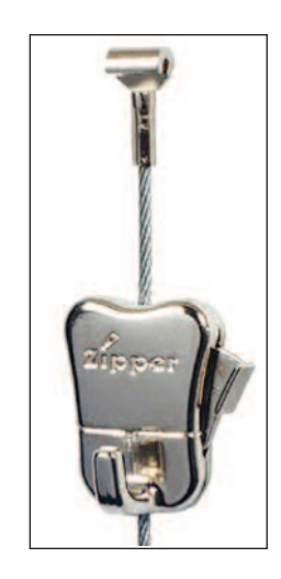
The STAS Zipper on STAS Cobra cable will support 33 pounds and is easy to install and adjust as needed. Perlon and Zipper only support 22 pounds.

STAS J-Rail Max is designed for heavy paintings, professional displays, and offers a range of security options. Rails are installed using preset countersunk holes about every 10 inches for flathead screws. Steel or aluminum gallery rods are used rather than cables. Hooks vary for required picture weight with small basic steel J-Hooks rated for 5 kg/11 pounds to J-Security Hooks at 40 kg/88 pounds. All slide onto the 4mm square rods and self-lock at desired heights.