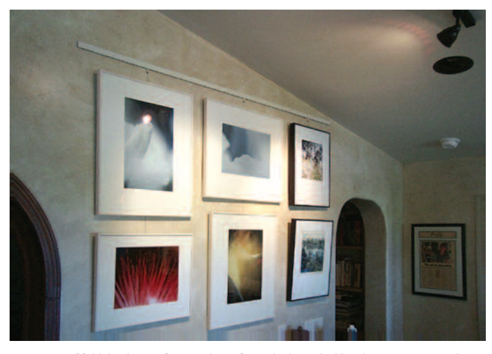
Multiple pieces of art are hung from single or double wires, not to exceed weight limitations. These are single wires. The customer opted for a horizontal rail rather than cathedral rail placement.

Choosing the right system starts with the hanging capacity. All system parts have a manufacturer calibrated rating for three times the weight of the framed art. If a rail, cable, or hook is listed as having a weight limit of 100 pounds, it will most likely hold 300 pounds. If multiple frames are to be hung on the same wire, then all must add up to less than the weight rating. Takiya heavy duty rails, for example, will support up to 150 pounds of art weight.