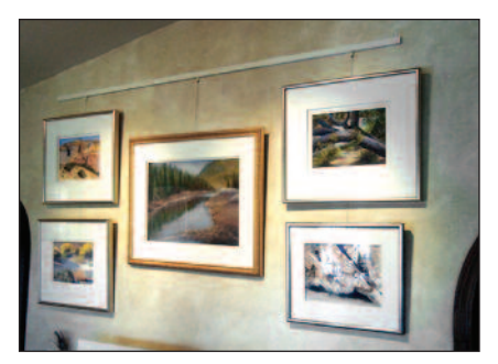
Vertical common line placement on single wires with horizontal common line for the three rows.

mon line. A bottom common line might also be used to visually showcase smaller works, like encaustic panels on small easels on a bookcase, creating visual continuity.