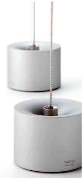
Takiya Line Pro medium weights are designed to stabilize their hanging cables to prevent art sway.