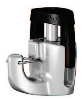
Newly's Squeeze Adjustable Hook H100S has a security clip and is rated at 44 pounds. Squeeze down on the top, slide to locate, and release to lock in place.