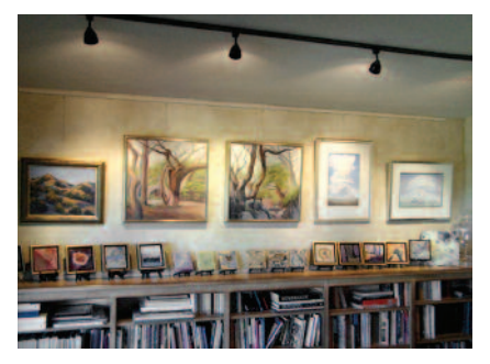
This small studio/gallery was installed in 2010 for Walker-Strahan Gallery, Redding, CA, using an Arakawa rail, cable, and hanger system.