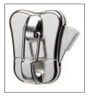
The STAS Zipper Pro security hangers lie flatter against the wall and are easy to install, squeeze to adjust, release to selflock, as needed.

the lightweight screw hooks are only 5 kg/11 pounds. Cables are available as perlon--two synthetic polyamide fibers similar to nylon--translucent steel cable, silver steel rod, and white.