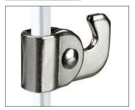
STAS J-Rail hooks slide onto 4mm square rods that self-lock at desired heights. Basic steel J-hooks are rated for 11 pounds.

plus Zipper hanger is not as strong, rated at 10 kg/22 pounds, while steel plus Zipper is rated at 15 kg/33 pounds per hook. The Zippers are easy to install, squeeze to adjust, and release to self-lock. It is a flat shape, which allows the frame to hang closer to wall. The patented STAS Zipper pro is equipped with an extra theft-delaying bracket, which also helps hold art if bumped or during earthquakes.