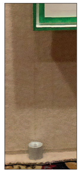
Two-wire installa tion with safety hangers and Takiya Line Pro medium weights to stabilize the hanging cables and prevent art swav.

Newly has a wide assortment of variations, including squeeze adjustable, self-locking, screw-locking, solo hangers, and sloping stoppers. Push the top of the hook down to slide, then release to firmly relock in place. Twister suspenders and squeeze hooks are rated at 20 kg, and