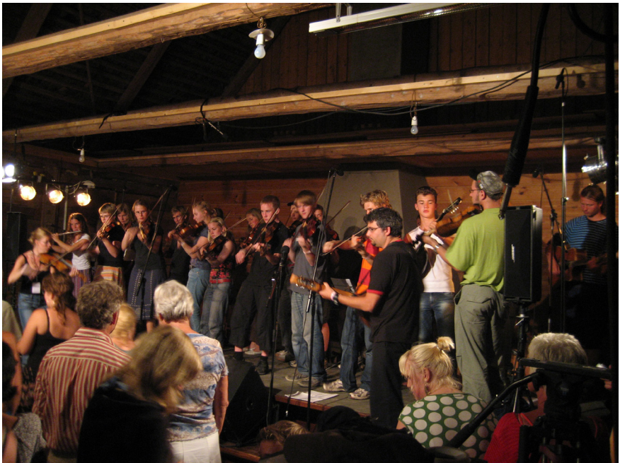
The regeneration of interest among polska musicians is good. Korrö 2006.

I think that what’s special about the polska is the beat and the music in general. What I think is good about polska dance is that once you find the beat, it is hard to lose the beat of the music. You become one with the music. (Nor19)