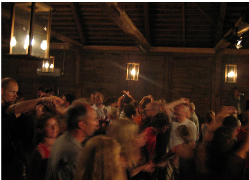
Korro Folk Music Festival 2006.

In other words, it is polska as dance that is the focus of his book, not the music. This is an important statement, for some readers possibly provocative, as many practitioners and researchers regard music and dance as a unit. The idea here is to place the dance at the centre and not turn it into an appendage to musicological research, theatre research, sociology or any other discipline. I prefer to start from the other end and begin by looking at the dance and the movement and then “append” the music.