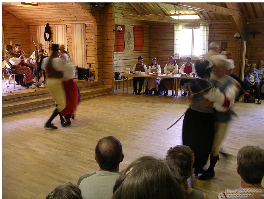
Competition performance for polska dance medals at Orsa, 2003. On stage are the musicians, on the right the judges, on the left outside the picture the administrators and in the foreground the onlookers. The dancing couples are being judged.

Another perspective is to state that, among the folk music people, particularly the younger ones, the large group does after all consist of pleasure dancers and not of aesthetes. They have become interested in polska dancing because of the special music. Even those who began their dance careers within the folk dance groups have become interested in the polska due to the music, not initially via the dance. They have, so to speak, changed repertoire because