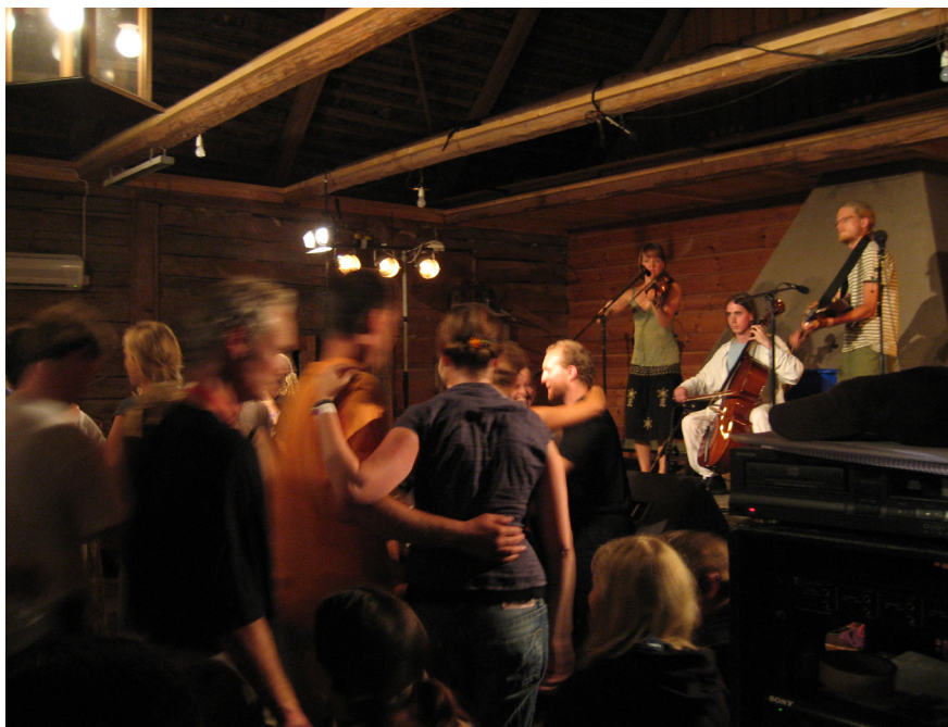
Good live music is one of the most important ingredients for polska dancing. Korrö 2006.

In other contexts, I have argued that the dance music and what I call the