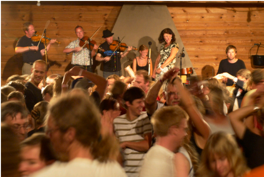
Dance evening at Korrö folk music festival, 2006. On stage the local band Sågskära.

Informal networks, word of mouth communications, are absolutely key for finding out where and when polska is being played and danced. Networks of people who know each other are the most common channels for keeping informed. Other common routes of information are via dance halls and courses. But that presupposes being in touch with these in order to get access to the media used for disseminating news of the activities. Of the journals or magazines it is mainly Folklore Centrums informationsblad (the Folklore Centrum pamphlet), Folkmusik och dans (Folk Music and Dance), Hembygden (The Home Country) and Spelmannen (The Fiddler) which are important channels for spreading information.