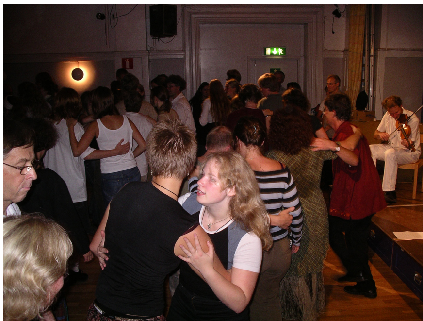
The Folk Music Café at Allégården in Gothenburg is one of the venues where the polska was revived in the 1970s, and where polska dancing still goes on 30 years later, 2003.