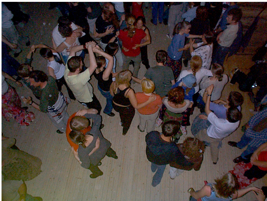
From the northern barn at Ransäter 1997. The fiddlers' gathering at Ransäter has, ever since its beginning in 1971, been one of the highlights for polska dancers and musicians.

different; yet it is young people from the high school level, up to the time they establish themselves with families, who dominate the dance floors. In the past, older people used to dance on special family occasions but not very often in between. Now, in the twenty-first century, there are special dance venues for pensioners and senior citizens ( seniordanser ), something that caught on in the late 1900s. 128 Dancing retirees probably formed the fastest growing group of dancers at that time. Another group that danced considerably less frequently in the old society is what we now refer to as people in their middle age. Mogendans , “mature dance”, the current expression for dance events aimed at the middle-aged, is still relatively common in Sweden even though this genre reached its peak during the 1980s. In the 1990s and 2000s, more exotic dance forms from around the world have been on the increase, and become popular among dancers in contemporary Sweden. 129 The majority of dancers in many of these contexts are middle-aged women and the dancing usually takes place at courses, or in clubs and associations.