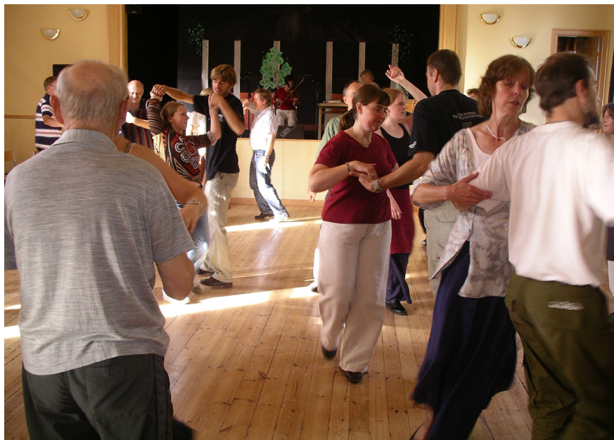
Polska on spot - slängpolska , at a dance workshop in Malexander, Östergötland, 2003.

Today, some of the younger dancers use the folk minuet ( menuett ), revived around 1990, as a figure motif when dancing slängpolska . In the minuet, the dancer moves over six beats (two bars of music), but rests on the 2nd and