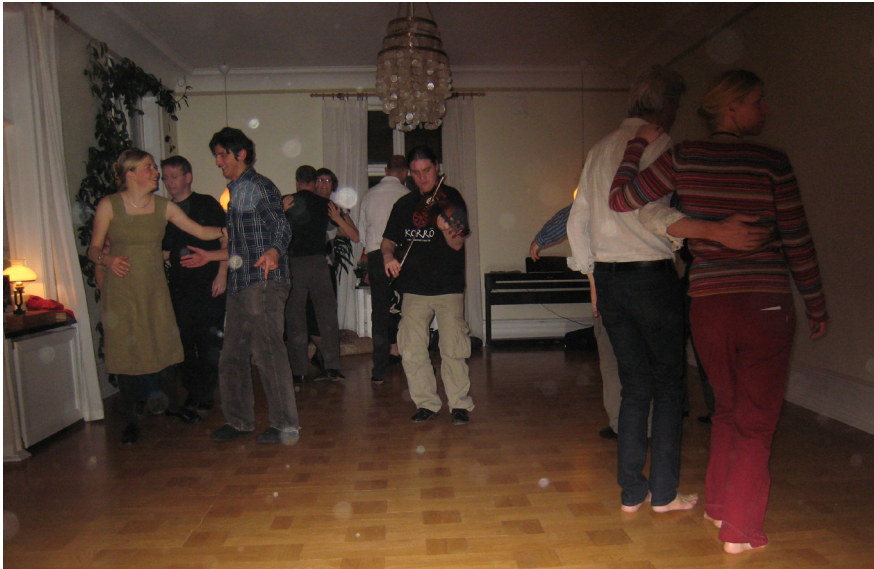
Polska dancing at a private party in Gothenburg, 2009.

Enjoyment on every level. Dancing together. Regardless of whether the polska is tranquil or quick, there's a wish to move together which makes me want to dance more and experience more. The 3/4 beat makes me feel great! The similarity for me is that dance is pleasurable in all its forms, from disco, bugg , modern – snoa (Swedish turning dance in duple metre) and polskas. (Malin)