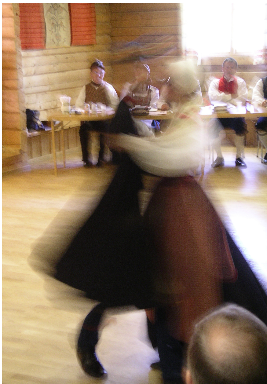
The polska is just as hard to express in words, as it is to catch the turning of the polska in a photograph. Orsa 2003.