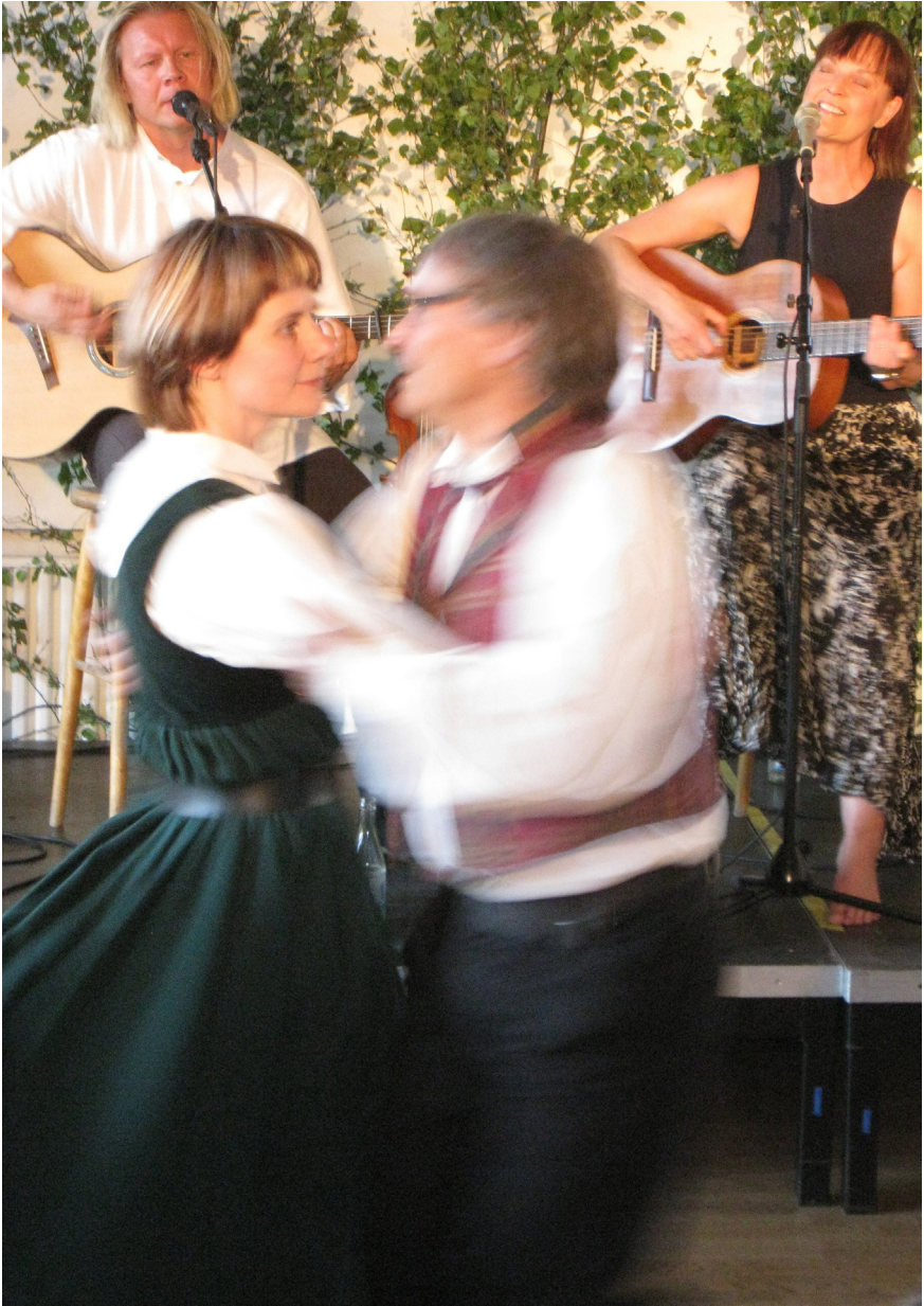
The researcher and dancer – one and the same person. Gothenburg 2008.