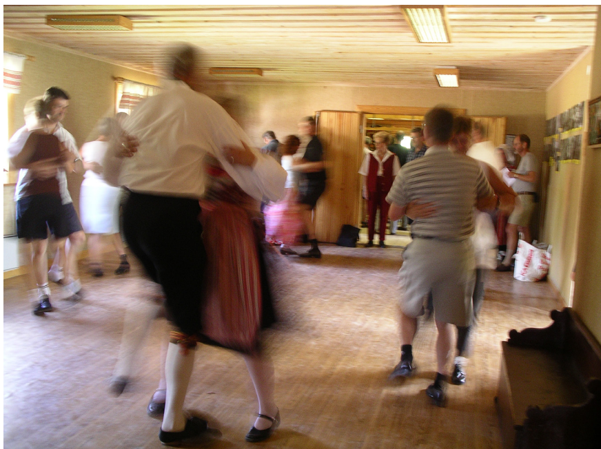
Practicing polska in waltz direction/ rundpolska before the polska dance medal competition ( polskmärkesuppdansningen ), in Orsa, 2003.

of slängpolska I use the expression polska on spot ( polska på fläck ), where slängpolska becomes the largest subgroup. 36