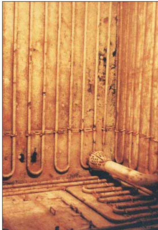
A fish holding tank inside a tuna fishing vessel before relining. The difficulty of access caused by the ammonia refrigerant piping should be considered when preparing a specification for relining.

A color contrast should exist between each lining in a system, including the stripe coating, to help measure dfts. Unfortunately, many tank lining materials are manufactured in only 2 colors, for instance, white and buff. However, for the