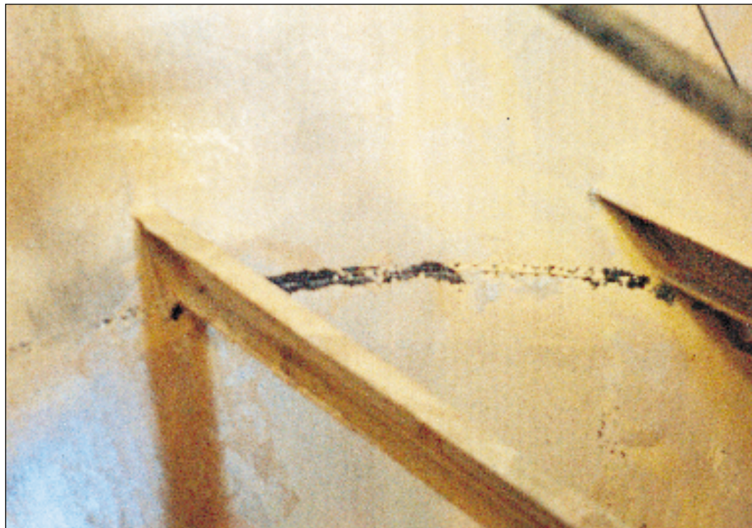
A lining failure inside a cement sludge tank caused by poor site preparation and poor coating of the field welds.

For relining projects where the existing lining has not completely deteriorated, it is worthwhile to evaluate the life expectancy of the existing lining system until full removal is required. If there is only localized damage (blistering and minor pitting), the