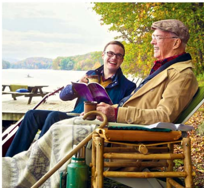
Imitate Jehovah by showing love (See paragraph 7)

13. What way of life did Eve possibly picture in her mind?