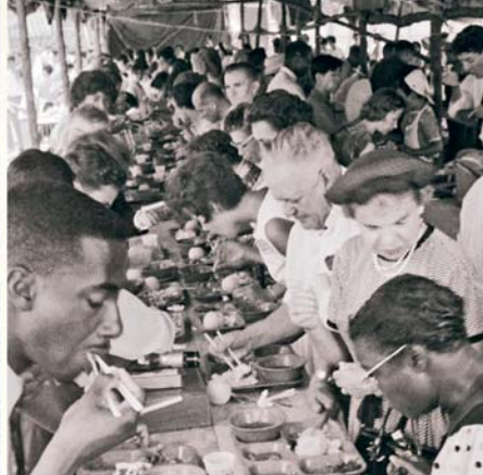
Seoul, Korea, 1963