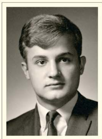
As a young person, I had some exposure to the truth