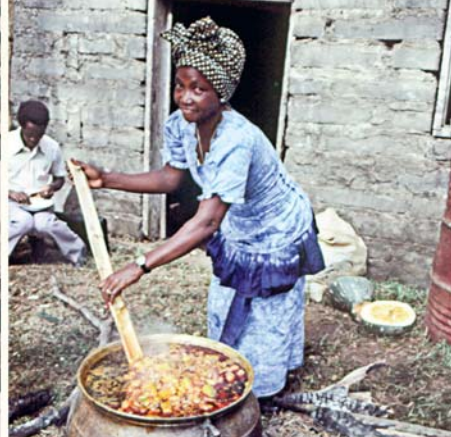
Sierra Leone, 1982

kettles. Servers dished out 30,000 meals an hour. To lighten the load for the 576 workers in the dishwashing department, conventioners brought their own knives and forks. In Yangon, Myanmar, thoughtful cooks used fewer fiery chilies than usual in dishes served to international delegates.