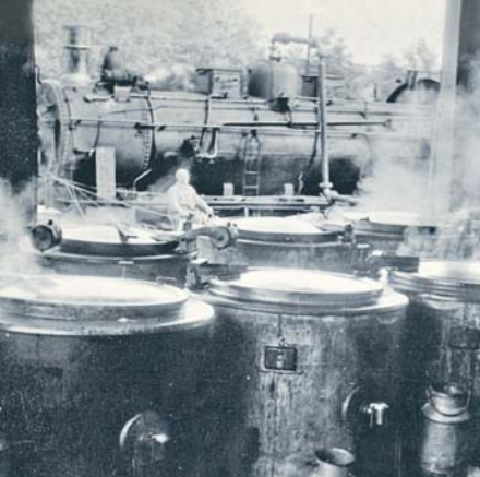
Frankfurt, Germany, 1951