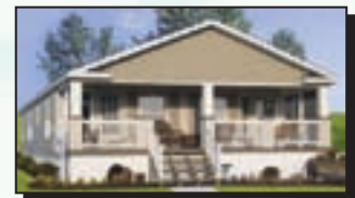
Integrity Modular Log Homes