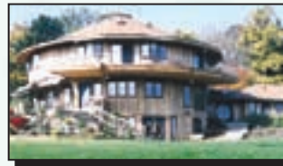
Eagle's Nest Panelized Homes