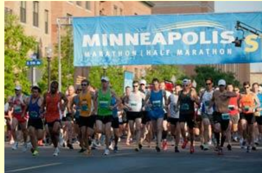
2012 Minneapolis Marathon starting line

Police will open roads after the last runner has gone past. More information is available at www.minneapolismarathon.com .