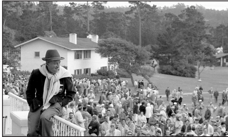
Bing Crosby at the 17th hole on Jan. 12, 1958.