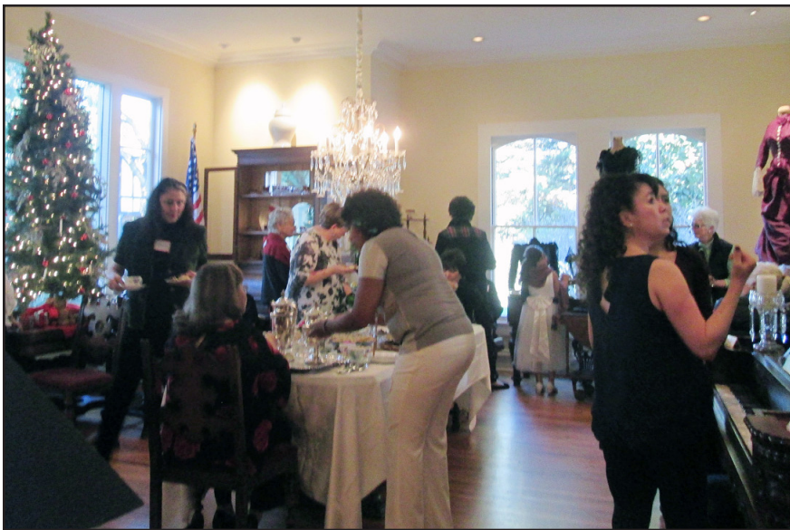
The Christmas Tea was another success in 2017.

The ledgers are filled with interesting tidbits, prices and surnames still familiar in our area today—perhaps your own. Please come to the PVHA Archive during open hours to help. We will supply the ledgers, a quiet corner, and plenty of advice. If you find the Parkhurst entry in the pile of ledgers, we will reward you with a small gift, our thanks, and the knowledge you have been a true history detective.