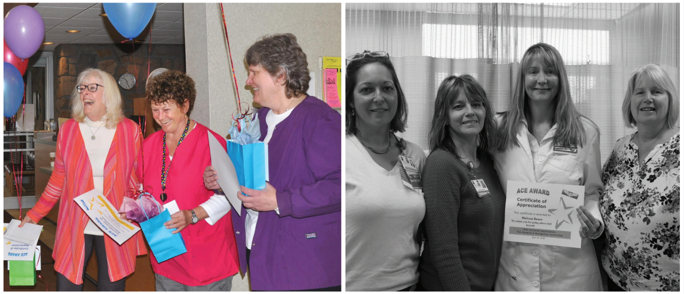
The A.C.E. Award was presented twice in April to four employees.

The A.C.E. Award, or the Awards Celebrating Employees, is one of the highest honors Nathan Littauer Hospital & Nursing Home bestows upon its employees. The award can be given to any employee who does something extraordinary outside the scope of their role within the organization to help others.