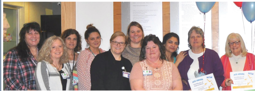
An A.C.E. Award Presentation in April.

Littauer Rewards & Recognition Committee: The purpose of the Nathan Littauer Hospital & Nursing Home Employee Reward and