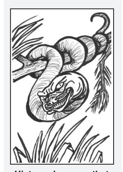
History shows us that, from Eden until now, Satan always uses tricks and lies (Revelation 20:8) to get what he wants.

READ FOR THIS WEEK'S LESSON: Revelation 2:13, 24; 2 Corinthians 11:13–15; Psalm 146:4; Revelation 13:1–17.