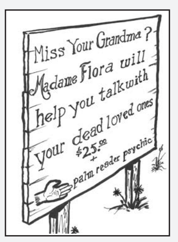
Some people believe that the soul goes on living after the body dies. The people who believe this lie are in deep danger from being tricked by other lies that come from believing we can talk to dead spirits.

As Christians, why must we trust Bible truths, even when our experiences seem to go against those truths?