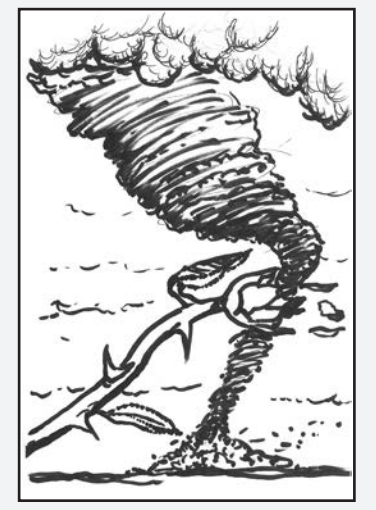
"Now nature showed Satan's hate for God and that there was evil. Nature would now always be filled with warning to man about what would happen when he sinned."—Ellen G. White, Education, page 26; adapted.

What other reasons can you think of that make a belief in evolution so dangerous in these last days?