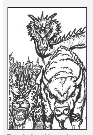
Revelation 13 teaches us there is a false three-in-one god. Who is it? The dragon, the wild animal from the sea, and the wild animal from the ground.

What are more of Satan's tricks in the last days? How can we protect against them and help people to do the same?