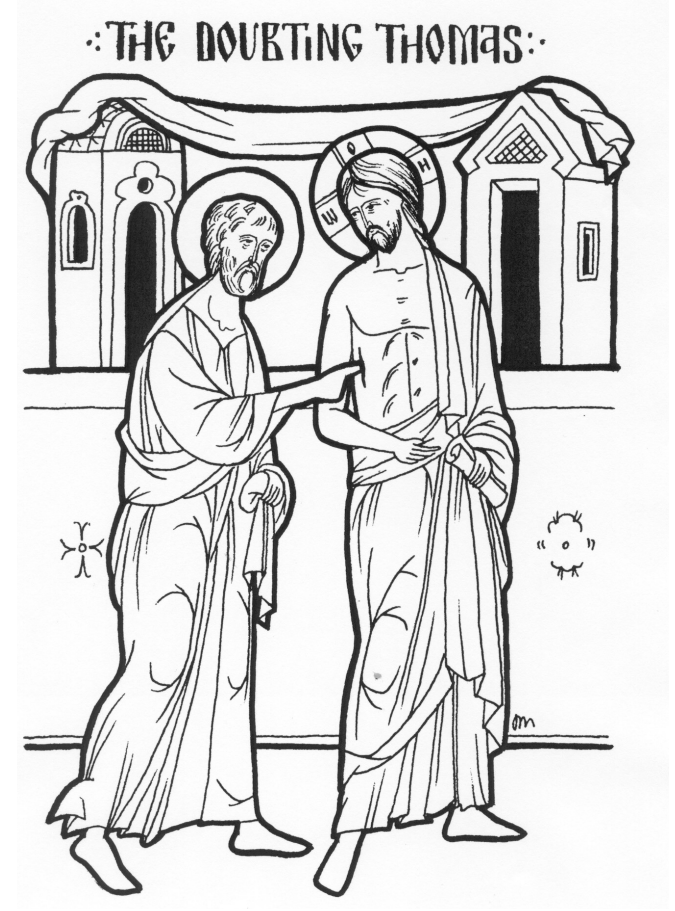
Icon courtesy of Iconographics (www.theologic.com)