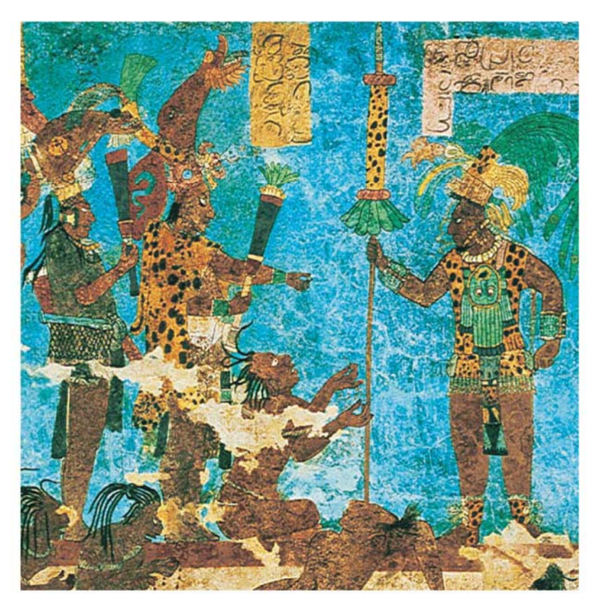
HUMANITIES CONNECTION This picture of Mayan warriors and their prisoners of war comes from Bonampak, a Mayan city that flourished 1,200 years ago. One building at Bonampak contains three rooms of murals, the most complete set of ancient paintings yet discovered in the New World.

hen comes the naming of those who are the midmost seers: the "Grandmother of Day, Grandmother of Light," as the Maker, Modeler called them. These are names