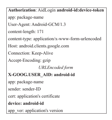
Figure 2: Registration Request

Specifically, what the adversary wants to do is to generate a registration request on behalf of the app on the victim's device (the tar-