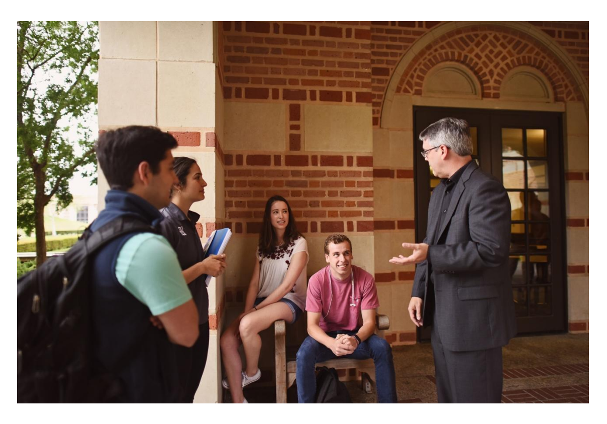
MBA Student Handbook

Student Program Office 2018 – 2019 Policies & Information Guide Jones Graduate School of Business