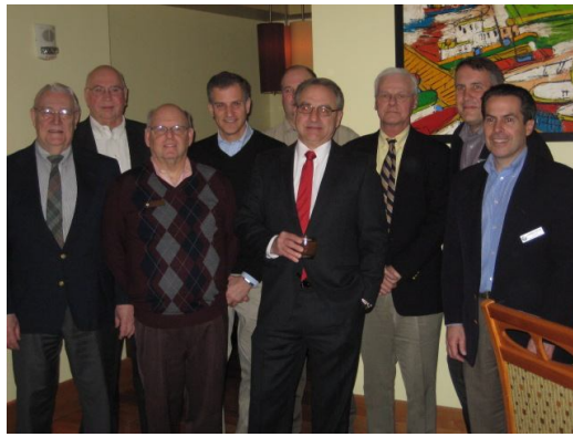
Officers and directors sans media drones