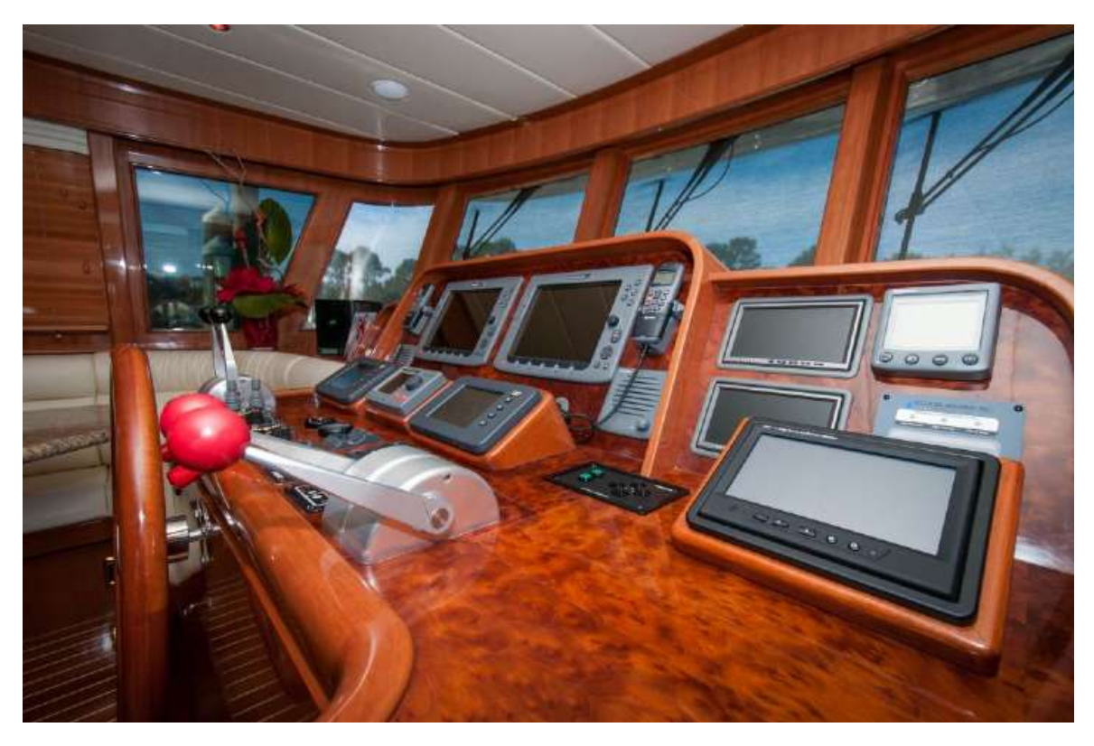
Pilot House Electrical Panel