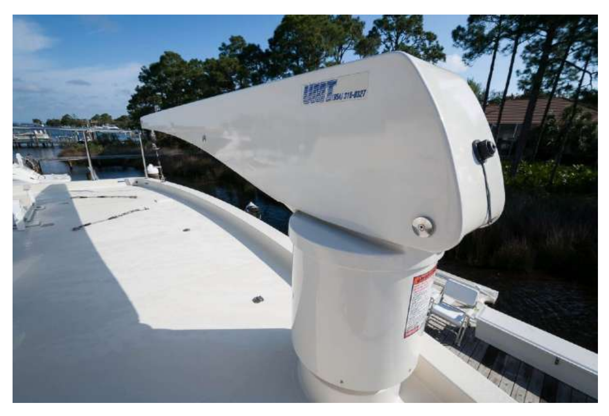
Port Aux Controls