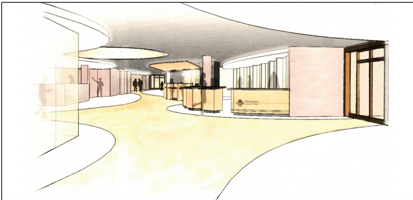
Architect's rendering of Students One-Stop center