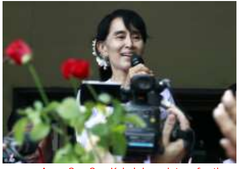
Aung San Suu Kyi claims victory for the Burmese people