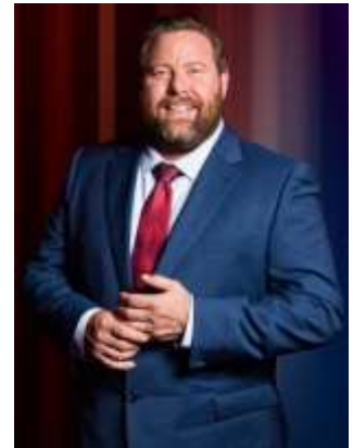
Shane Jacobson hosts Little Big Shots .

https://www.heraldsun.com.au/news/victoria/aussie-star-shane-jacobson-sued-for-1m-by-former-manager/news-story/fdb7e1a9e8d961f5e0ec2c18fbecc1e9