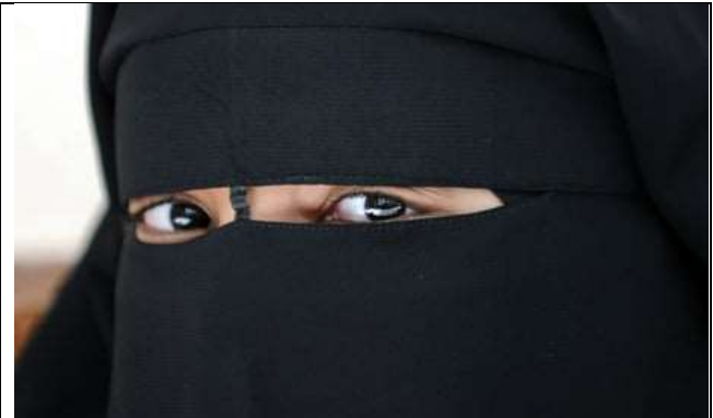
Woman cannot give evidence in a niqab, Australian court rules

The following article was written by Calla Wahlquist on the 18th of July 2018 for the online news service 'The Guardian', titled 'Victorian judge bans niqab in court's public gallery'.