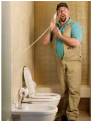
In character as 'Kenny'