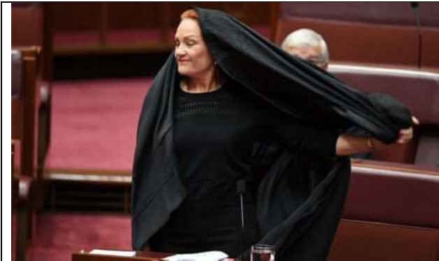
Pauline Hanson's burqa stunt could change Australian Senate's dress code

https://www.theguardian.com/australia-news/2018/jul/18/victorian-judge-bans-niqab-in-courts-public-gallery