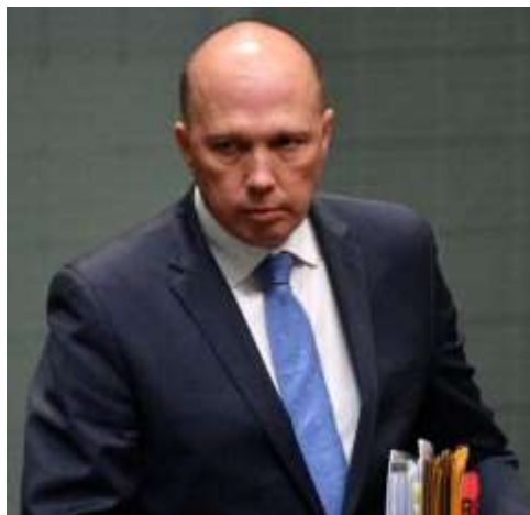
Minister for Home Affairs Peter Dutton.