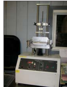
Thwing-Albert Score Bend Tester, Model 202