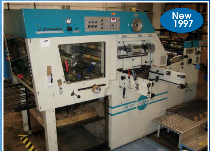
Gietz Model FSA 870 EFF Wide Foil Stamper

INSPECTION: MONDAY, AUGUST 24, 9:00 AM TO 4:00 PM