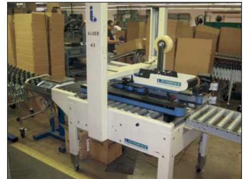
Interpac Carton Sealer Model USA 2024-SB w/Marsh Printer