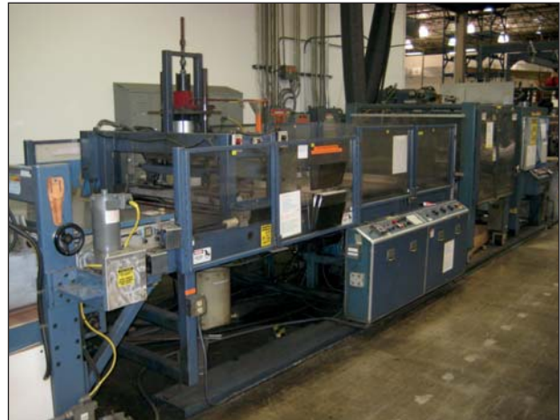
Kabar 40" Web Fed Creasing Machine