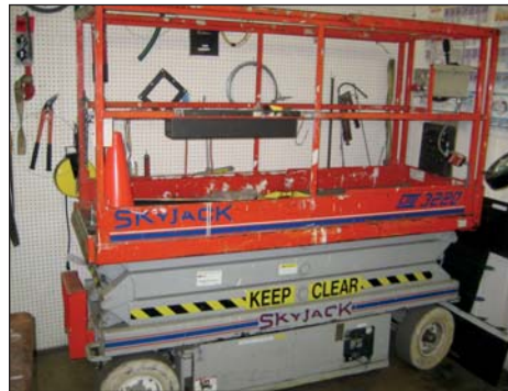
Skyjack Scissor Lift Model SJIII 3220