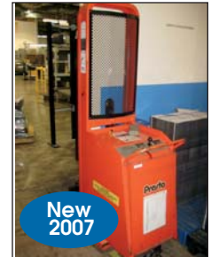
Presto Electric Walk Behind Lift Model STA2127