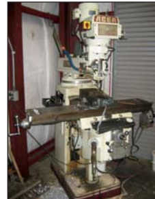
Acer Vertical Milling Machine Model Ultima 37K