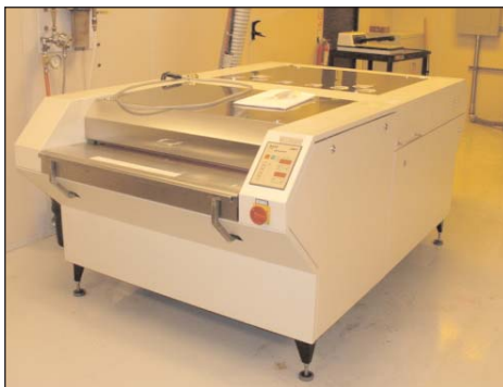
BASF 35" x 45" Plate Processor