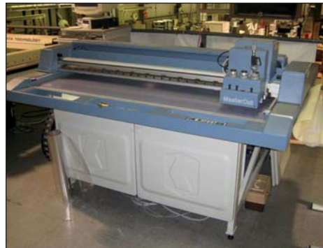
Data Technology Cutting Table