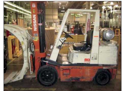
Nissan Forklift Model CRGH02F35V w/Roll Clamp