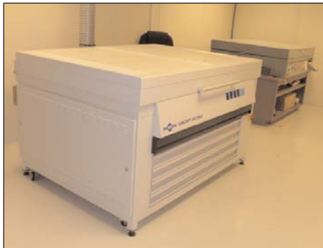
Merkom Concept 301 Flexo Plate Processor