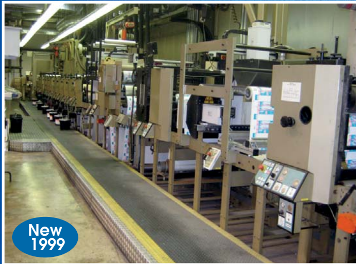
Aquaflex Chromas 10/C Flexo Press Model ZXBM 2410

SALE DATE: TUESDAY, AUGUST 25, 2009 10:30 AM (EDT)