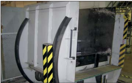
Automatan Jogger/Aerator/Pile Inverter Model A73VA