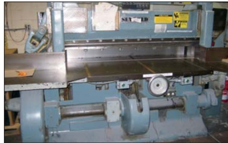
Seybold 64" Guillotine Paper Cutter