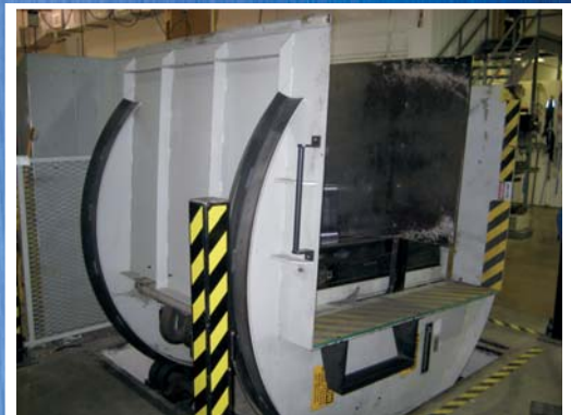
Automatan Jogger/Aerator/Pile Inverter Model A73VA

AUCTION INFORMATION: THOMAS INDUSTRIES 203 458 0709 WWW.THOMASAUCTION.COM