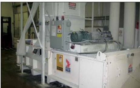
American Horizontal Baler Model Predator III