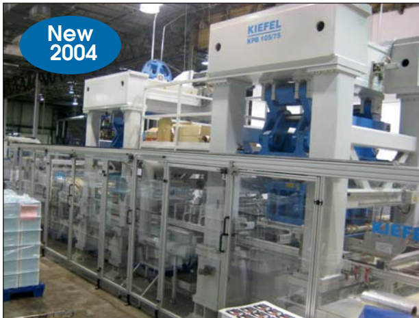
Kiefel Creasing Machine Model KPB 105/75