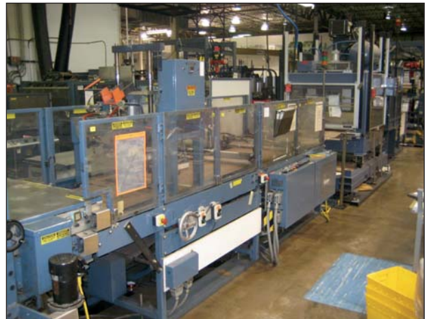
Kabar 25" Web Fed Creasing Machine