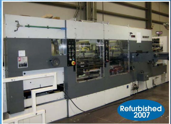
Bobst Die Cutter Model Autoplatine SP102-CER