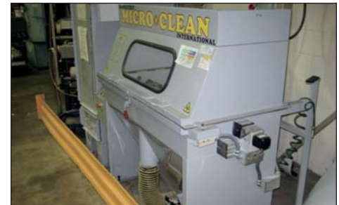
Microclean International Cleaning System