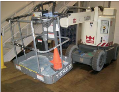
Terex Manlift Model TA30N

SALE DATE: TUESDAY, AUGUST 25 10:30 AM (EDT)