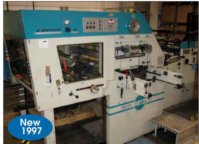
Gietz Model FSA 870 EFF Wide Foil Stamper