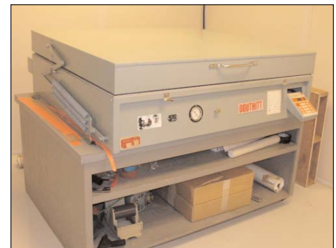
Douthit "Cool Print" Exposure Unit