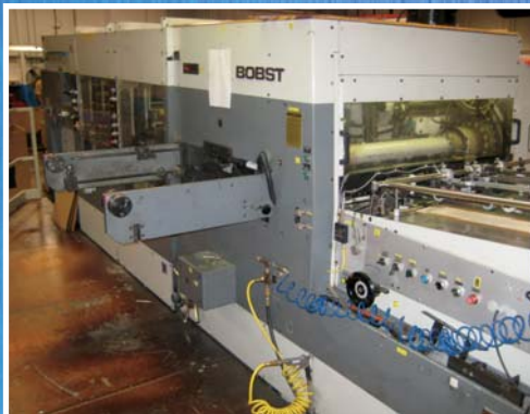
Bobst Die Cutter Model Autoplatine SP102-CER