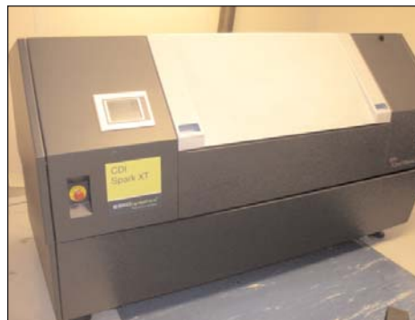
CDI Spark XT Laser Imager