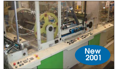
Esatec Window Machine Model MT-4B