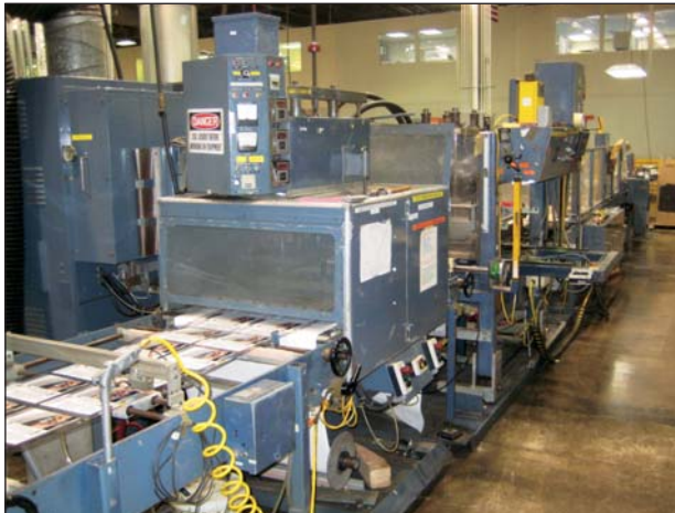
Kabar 25" Web Fed Creasing Machine