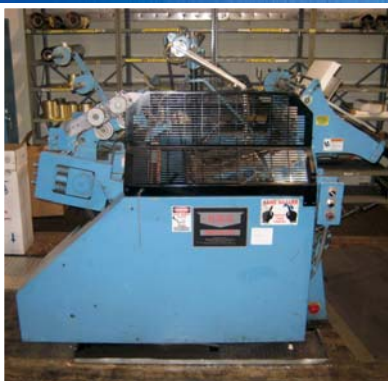
Kluge Die Cutter Model EHD 14x22