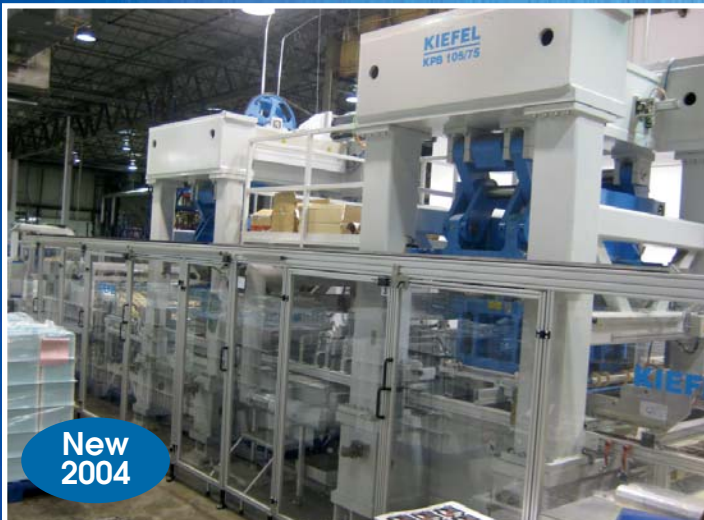
Kiefel Creasing Machine Model KPB 105/75