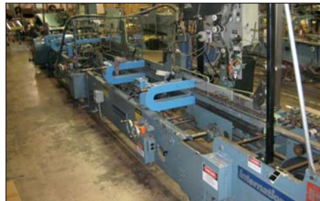
International Straight-Line Folder Gluer Model Royal 33