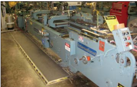
International Straight-Line Folder Gluer Model Royal 33