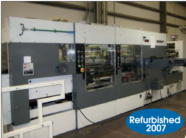
Bobst Die Cutter Model Autoplatine SP102-CER

SALE DATE: TUESDAY, AUGUST 25, 10:30 AM (EDT)