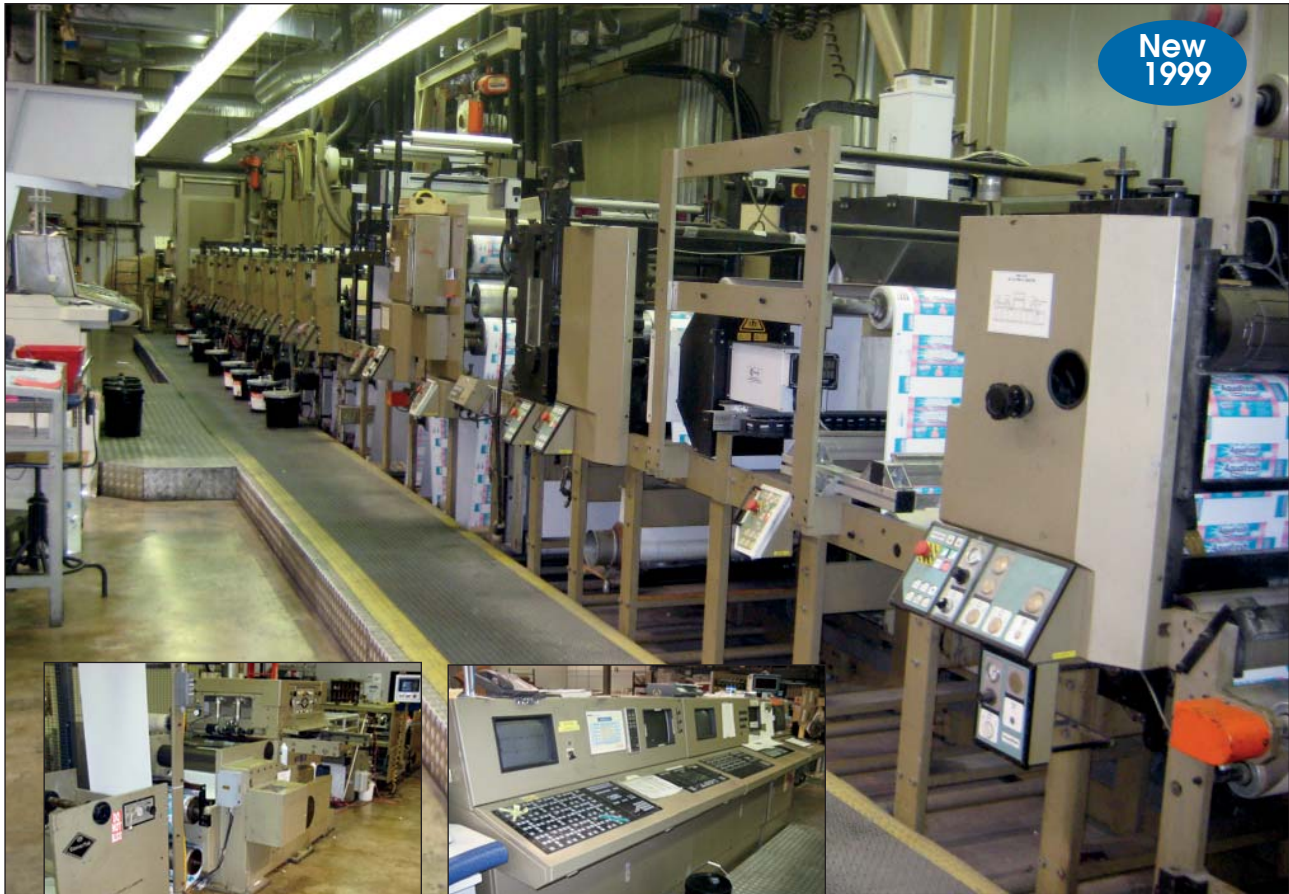
Aquaflex Chromas 10/C Flexo Press Model ZXBM 2410