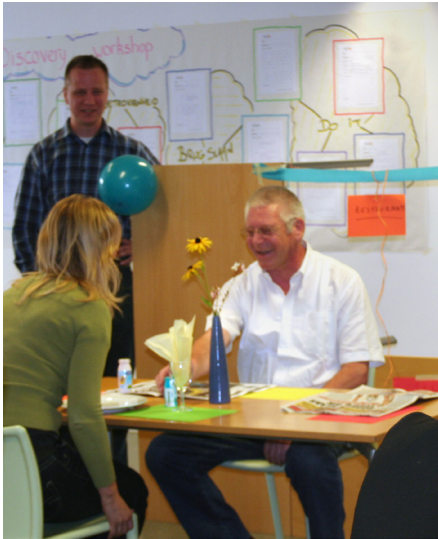
Creative role-playing in Belgium

experience gave us the confidence that using an appreciative approach to start change initiatives would generate a lot of hope and high energy as well as aspiration for change. Less certain for us is whether these early indicators of success can then be nurtured into a longer term sustainable and measurable change. Can we just rely on the energy that was unleashed in the inquiry or does that energy need the support of other tools and approaches to yield the hoped-for outcomes? AI teaches us that change begins with the first questions, but it doesn't teach us much about what happens after the inquiry, the workshop or the summit.