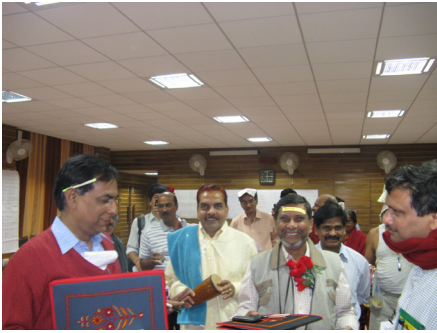
Engaging HR leadership in India