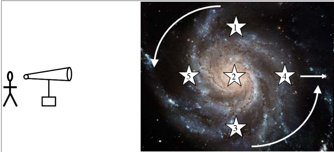
Figure1: Motion of gas in a galaxy viewed edge-on. The entire galaxy is moving away from us. Gas near star 1(3) is rotating toward(away) from us. Gas near stars 4 & 5 is moving across our line-of-sight.

star 1 will be moving toward us, the gas near star 3 will be moving away from us, and the gas near stars 4 and 5 will be moving across our line-of-sight. The measured velocity of a gas cloud near star 3 will therefore be the recession velocity plus a positive rotation velocity. Near star 1 the measured velocities will be the recession velocity plus a negative rotation velocity. Because the gas near stars 4 and 5 do not have any movement along our line of sight, the velocities measured there will be only the recession velocity. Going back to the top right side of Equation 3, we see that to isolate