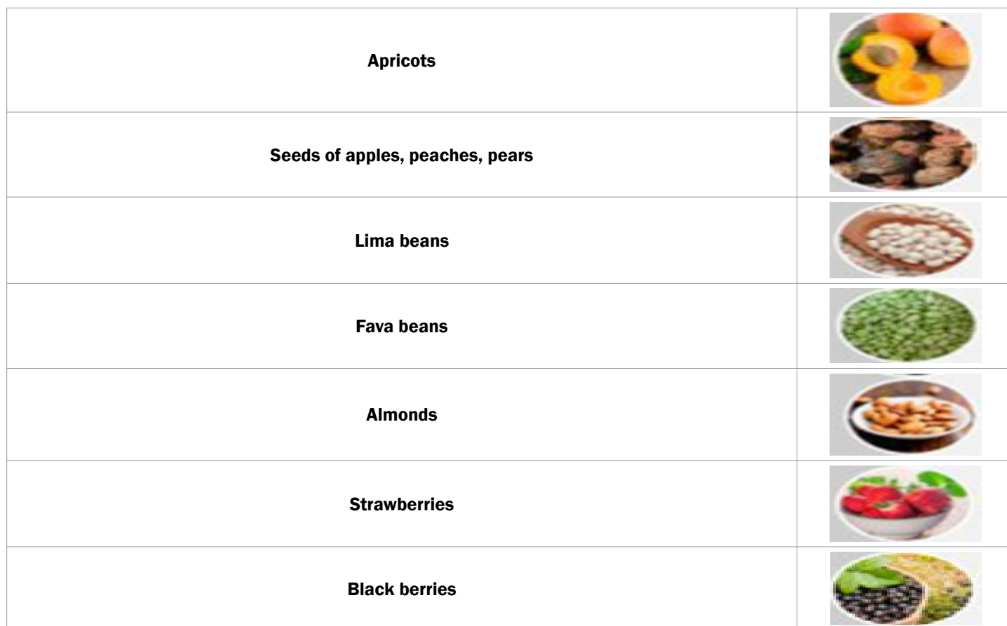
Table 1. Sources of vitamin B17.

Vitamin B17 has different benefits which can be summarized in the following points: