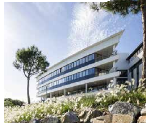
Left to right : CHU d'Amiens – Centre Antoine Lacassagne, Centre de lutte contre le cancer de Nice – Institut de Cancérologie de l'Ouest, Nantes