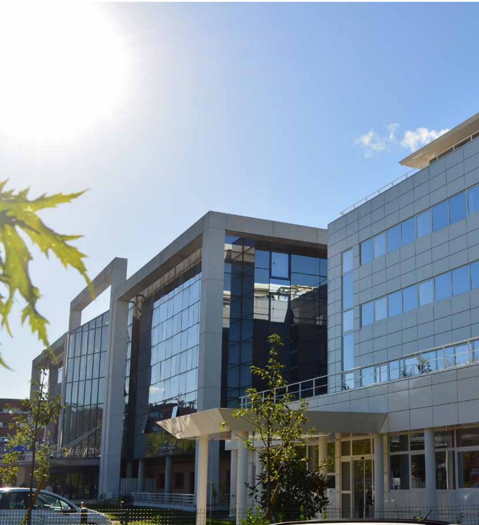
Clinique Claude Bernard, Ermont