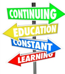
Programs In Every Direction