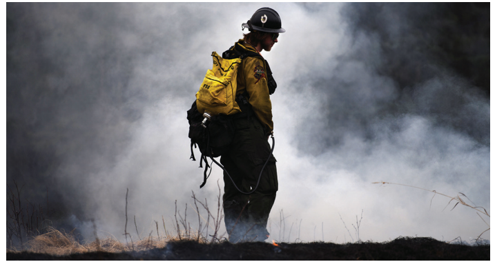
Alaska Division of Forestry firefighter

Sources: www.iii.org/fact-statistic/facts-statistics-wildfires ; http://newsroom.afba.com/uniformed-services-news/strong-bipartisan-effort-supports-a-key-benefit-for-federal-firefighters