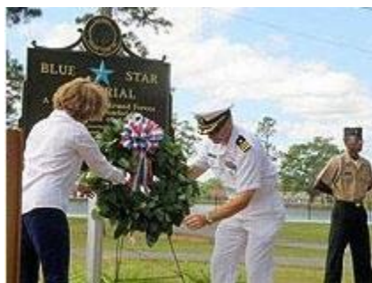
The Green Thumb Garden Club in Thomaston placed a Blue Star Marker as a tribute to the Armed Forces who have defended our country.