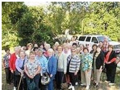
At the NGC Environmental Studies Tri-fresher held September 2012 at UGA Griffin, the class learns about an environmentally planned parking lot at Senoia.