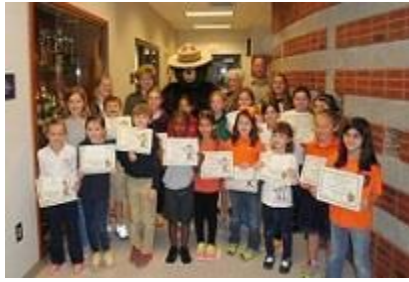
Valwood School students involved with the Smokey Bear Woodsy Owl contest enjoyed seeing Smokey Bear visit their school.