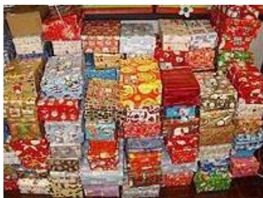
Smoke Rise Garden Club members annually wrap shoe boxes with Christmas paper, fill the boxes with toys, and deliver them to the Children's Healthcare of Atlanta/Egleston for distribution to the children.