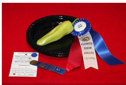
Garden club, an all-volunteer organization, provides opportunities for fellowship, winning awards, and community service.