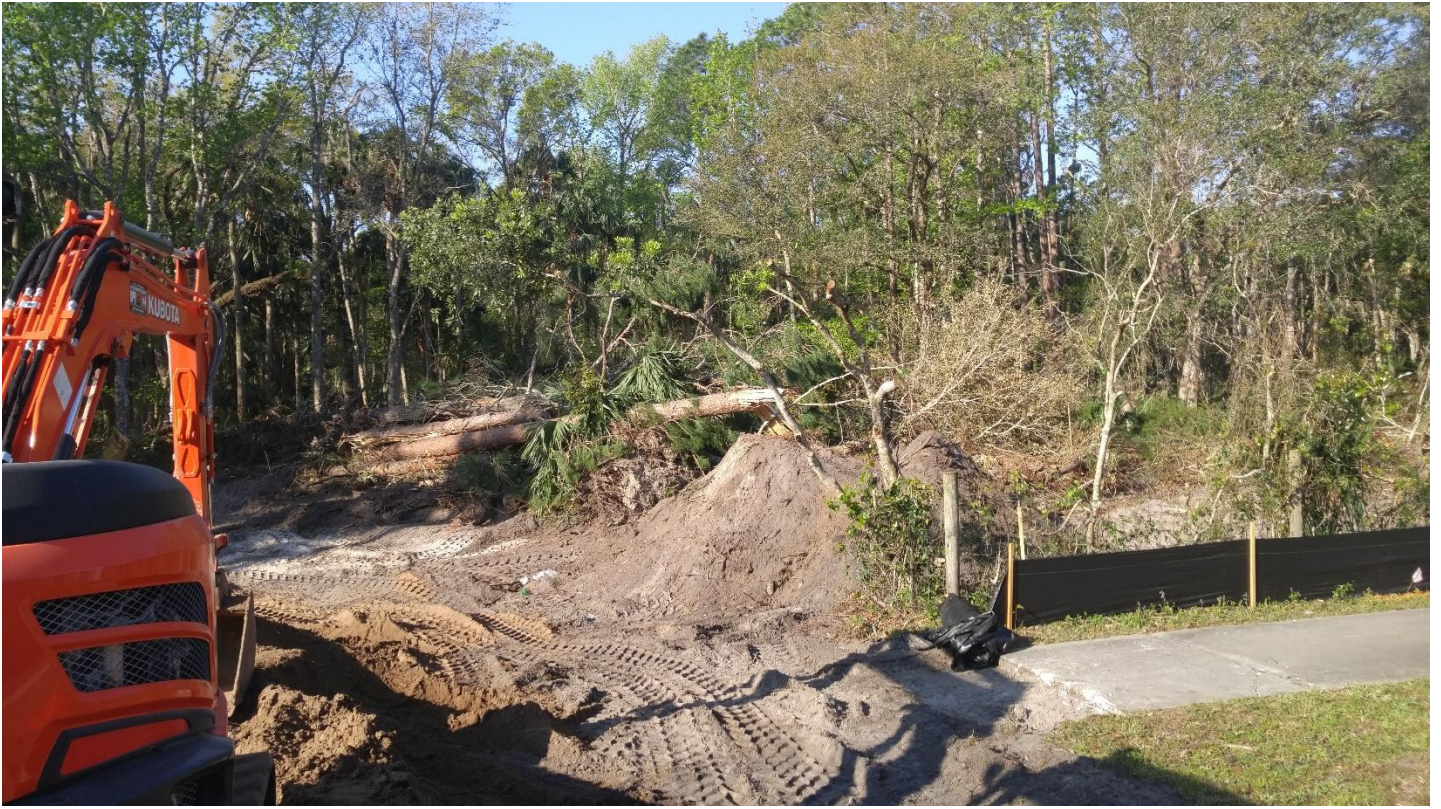
Tuscan Gardens - Entrance