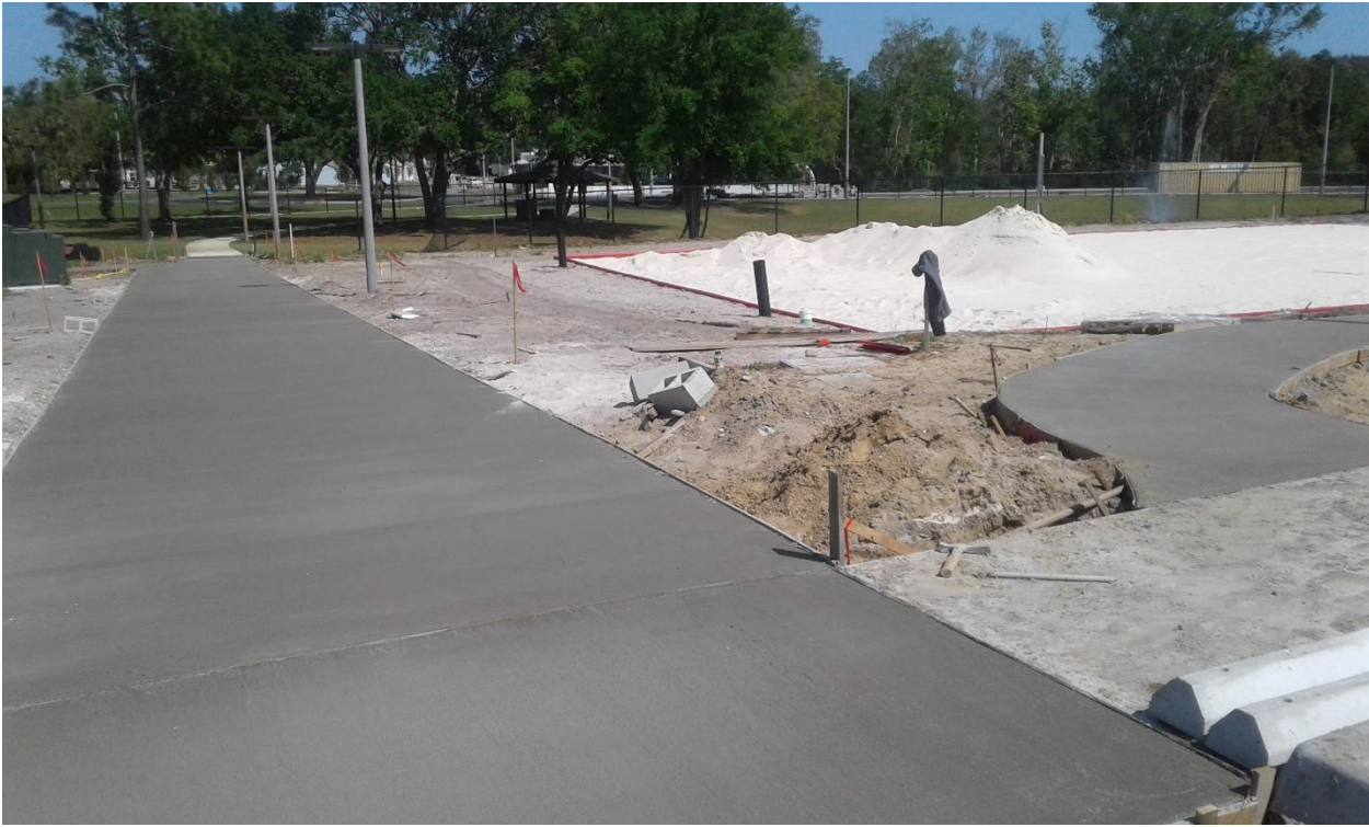
Holland Park – FP&L path sidewalk – volleyball