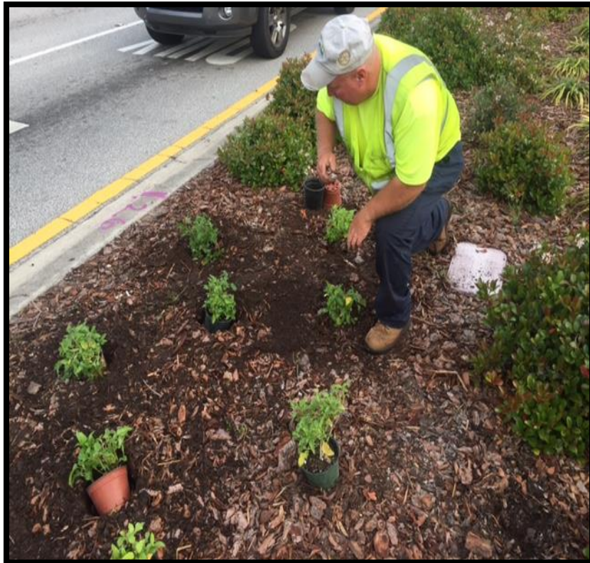
Plantings, Belle Terre Decorative Median