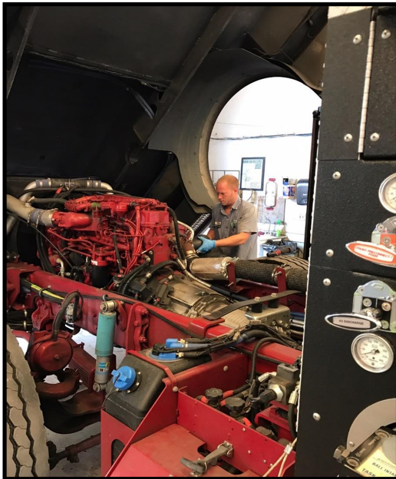
Preventative Maintenance, Fire Engine 22