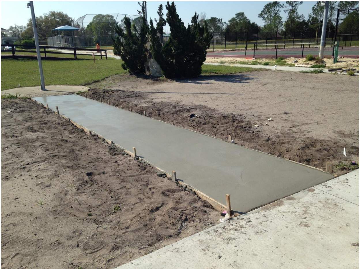
Holland Park – Sidewalk to Flag Pole