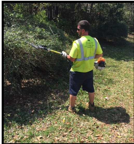
Right of Way Sight Distance Trimming, Oak Trails Blvd