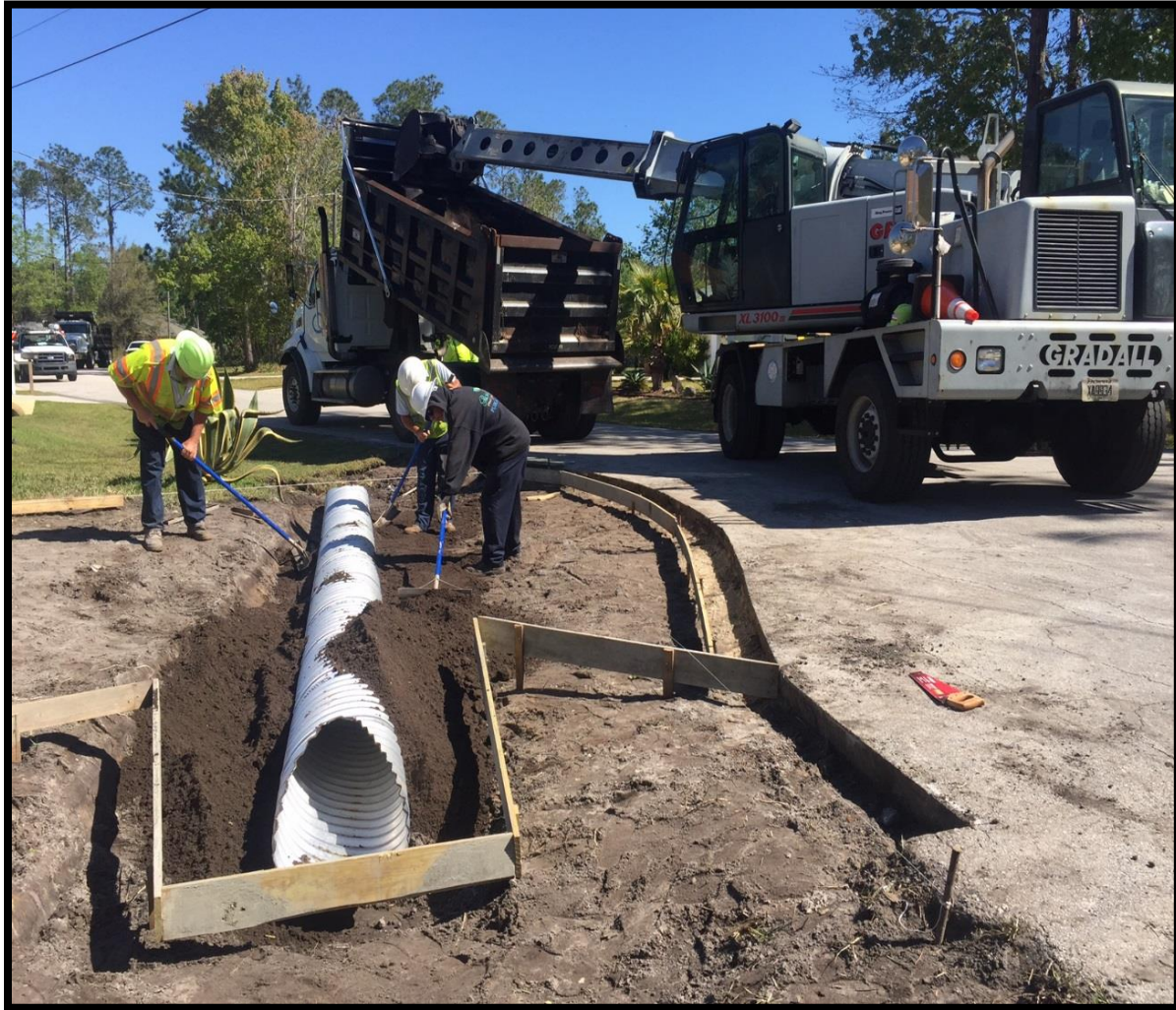
Culvert Pipe Installation, Zacharias Place