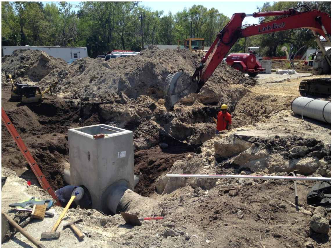
Community Center – Stormwater Structure