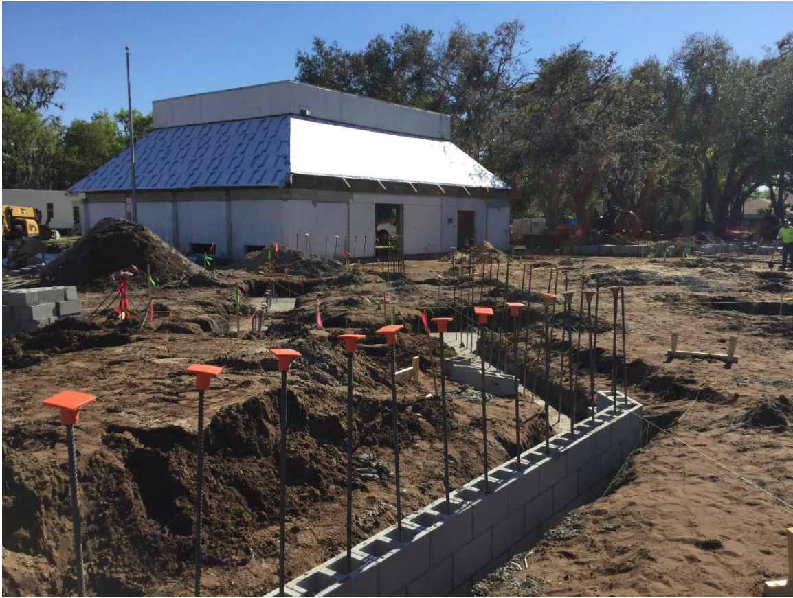
Community Center – Exterior Wall Block