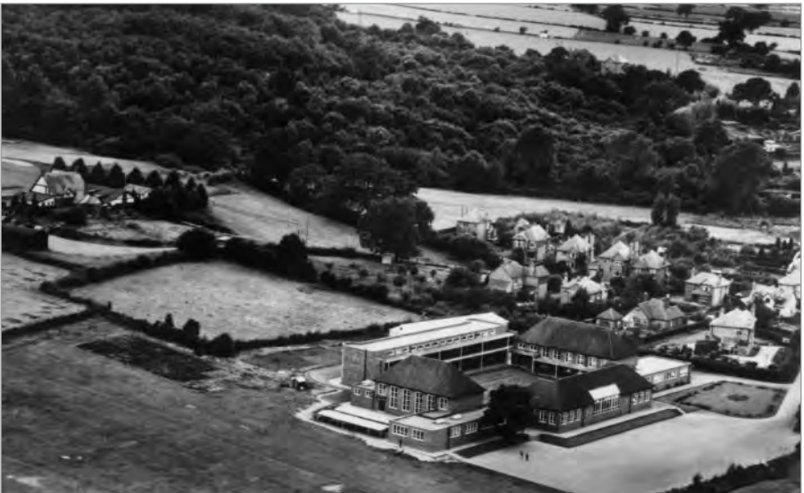
BOYS' GRAMMAR SCHOOL, GOLF LINKS LANE, 1940.