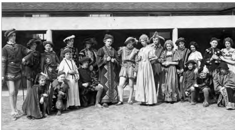
Members of the cast from the 1948 production of Shakespeare's Twelfth Night .

One of the things I valued most was the mutual respect and sense of fun that developed between staff and pupils. We rarely knew staff Christian names, nicknames were the order of the day.