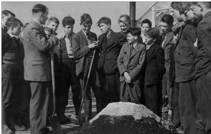
Modern School boys pay careful attention during their gardening lesson, c. 1950.