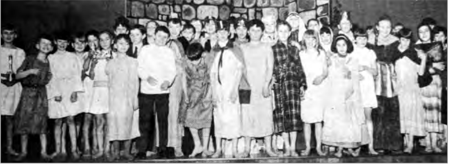
Cast of Blessed Robert Johnson pupils taking part in a play at the school in 1968.