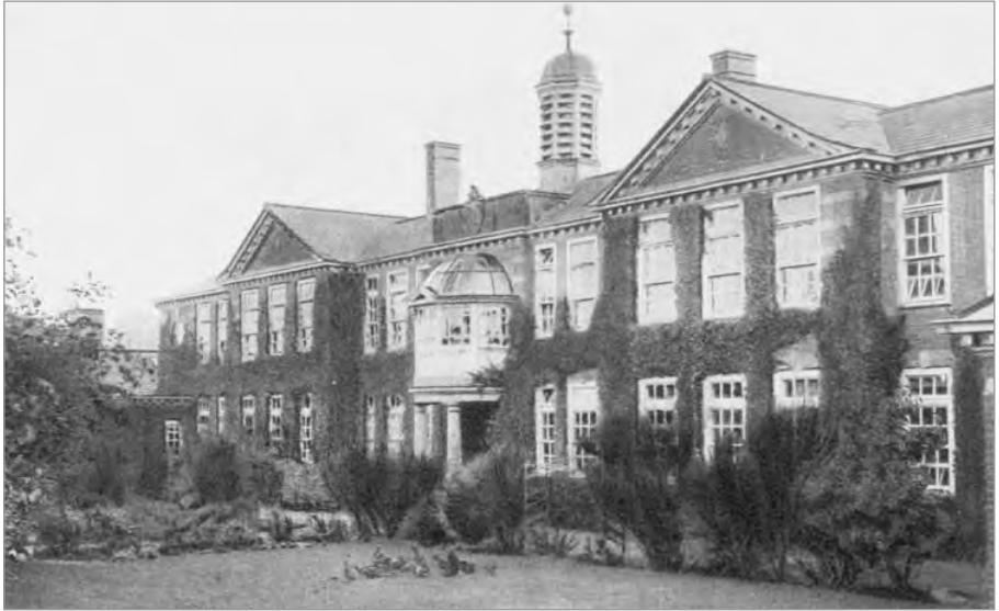
THE BOYS' AND GIRLS' HIGH SCHOOL, KING STREET, 1920S.