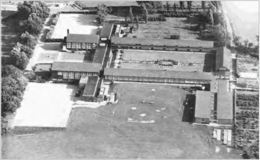
SECONDARY MODERN SCHOOL, ORLETON LANE, 1954.