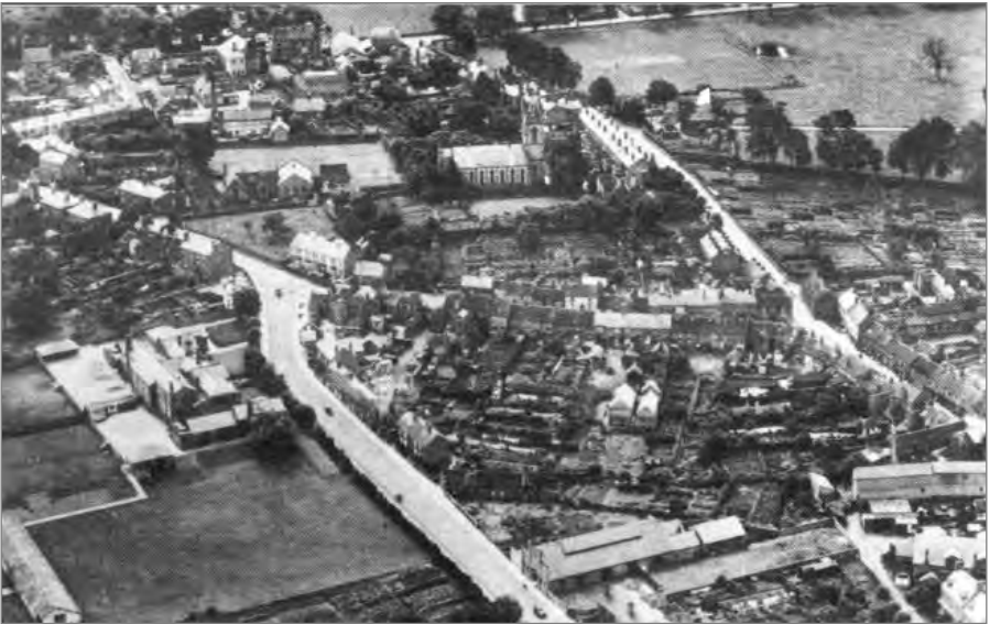
Combined Boys' and Girls' High School, bottom left. Photo possibly taken in the 1920s.