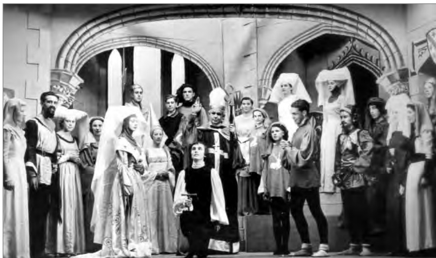
Girls' High production of St. Joan, 1950, including boys from the Grammar School.