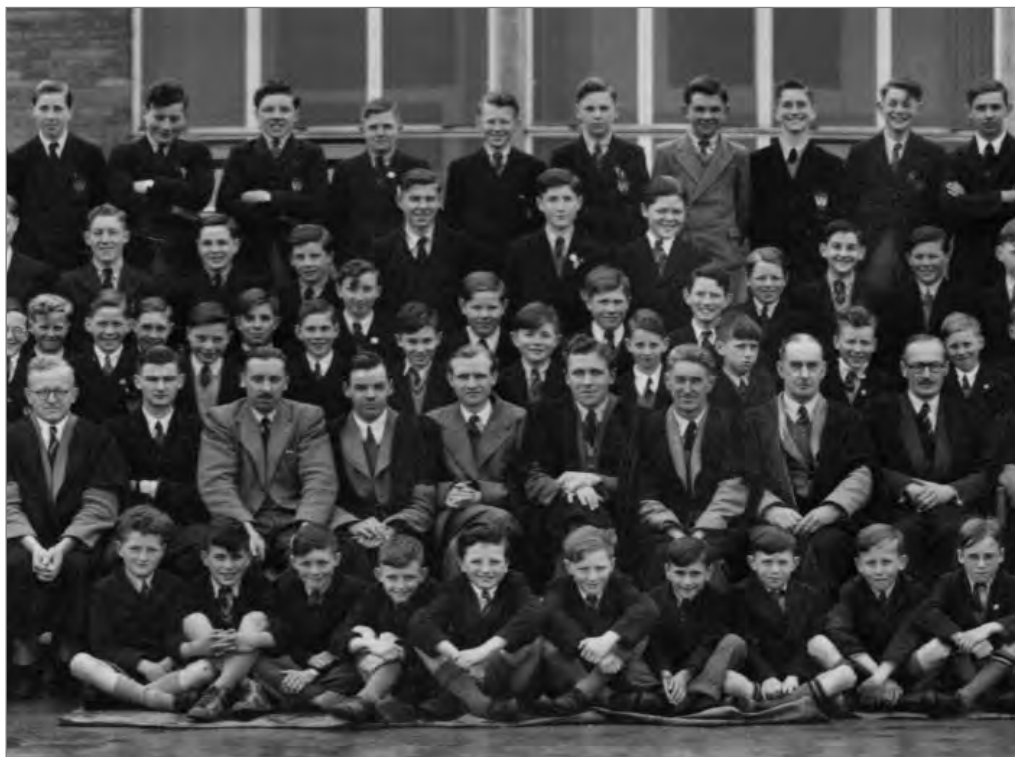
Boys' Grammar School, May 1952. Extract of a panoramic photograph.