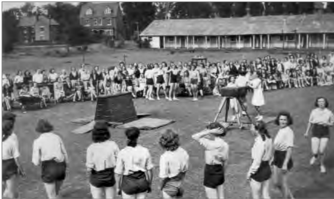
High School Sports Day, 1948, with the old classroom block along Regent Street.

Eventually it was time to leave the High School and move on, and I was not unhappy to do so. I always felt I could have done better if I had worked harder and I enjoyed a more relaxed atmosphere during my twelve months at Shrewsbury Technical College. I still have happy memories of my High School days and am pleased to have been in the class of ’39.