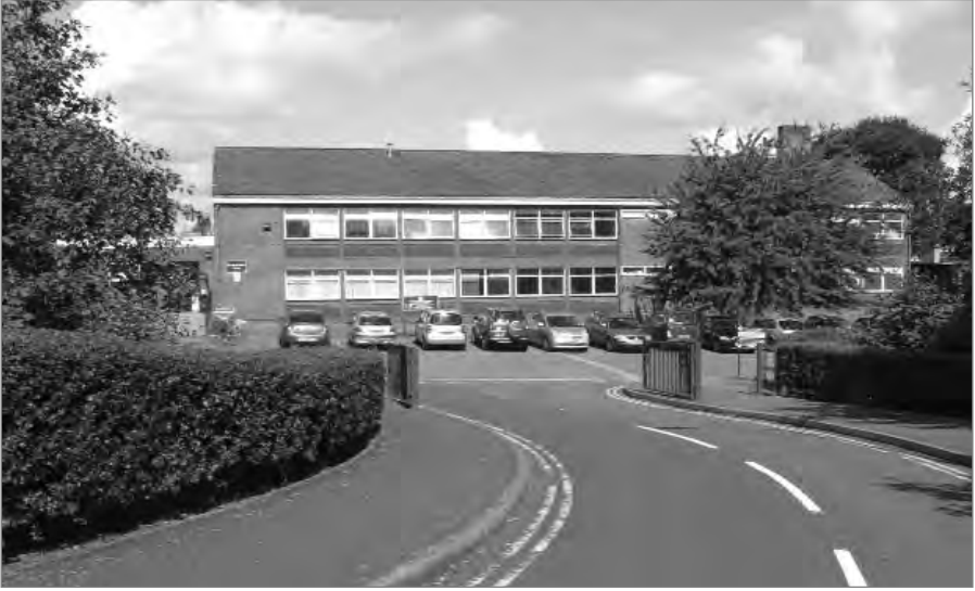
Entrance to Blessed Robert Johnson Catholic College, July 2008.