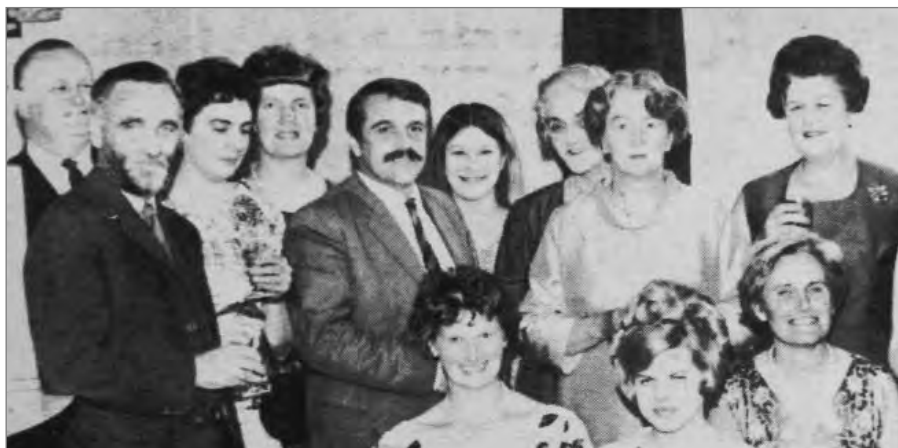
BRJ school staff enjoy an evening buffet at the Charlton Arms Hotel, 1968.