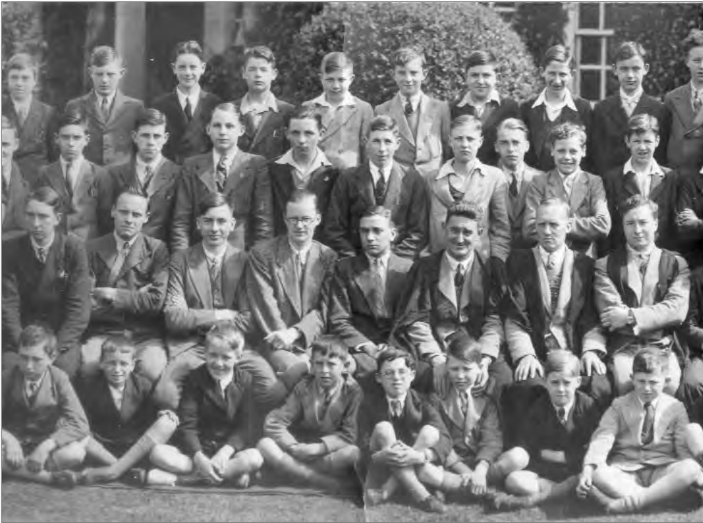
Boys' High School, mid 1930s. Extract of a panoramic photograph showing the teachers.