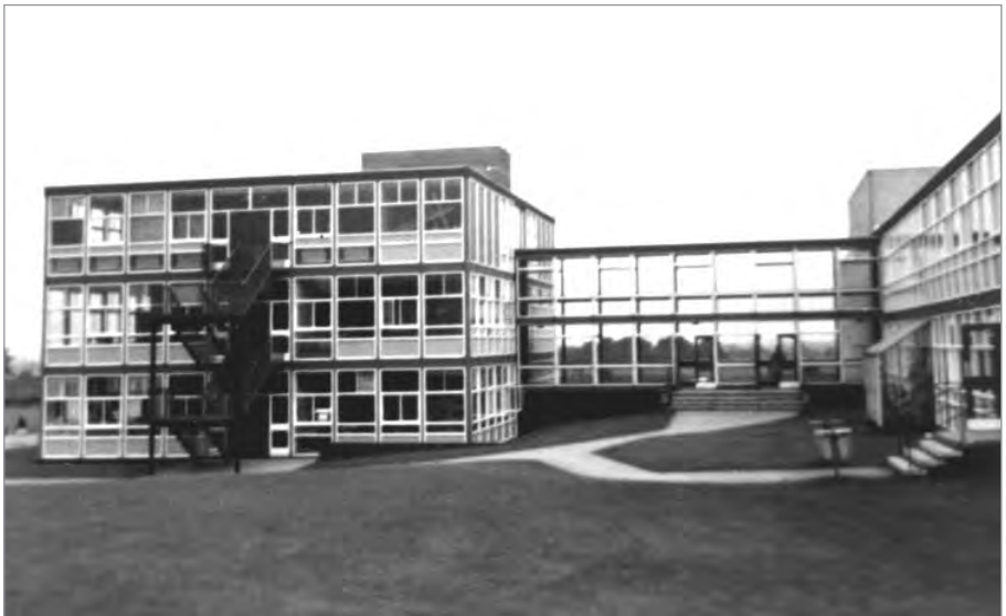
GIRLS' SECONDARY MODERN (LATER CHARLTON) SCHOOL, DOUTHILL, 1966.