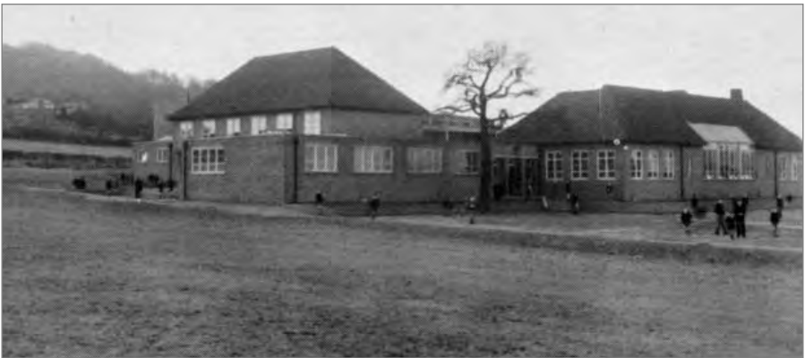
Boys' Grammar School as it was in 1943. The Art room, with windows projecting into the roof tiles, is on the right.

My 1st XI spell was not the most successful but included fixtures against Bridgnorth GS, Adams GS Wem, Oswestry Boys High, Bedstone School, Market Drayton GS, the Royal Wolverhampton School, Coalbrookdale High School and Harper Adams Agricultural College. It was at Edgmond that we nearly walked off the pitch after some savage, agricultural knee-high tackling.