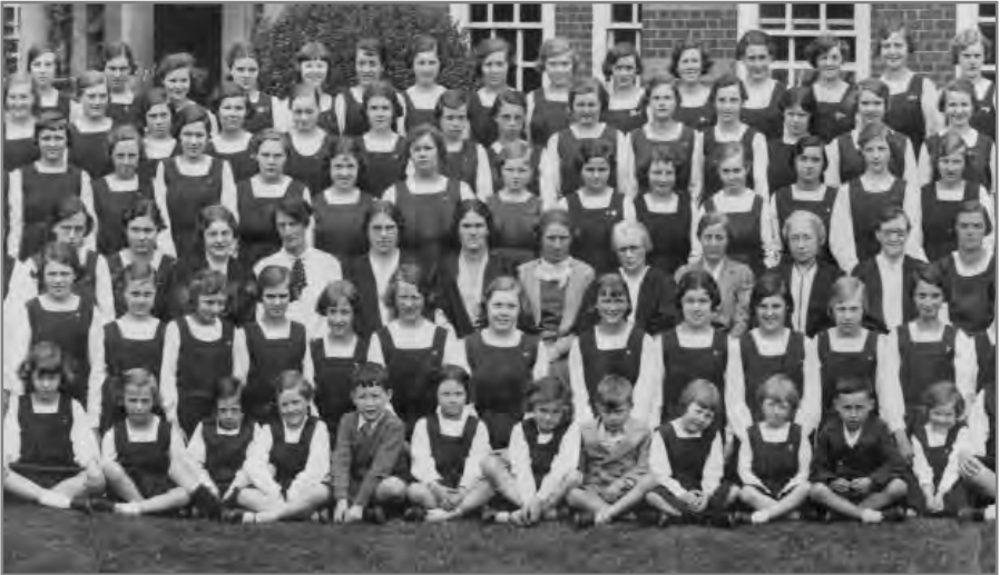
Extract from a 1935 panoramic photo of the Girls' High School. The first year included both young boys as well as girls at that time.