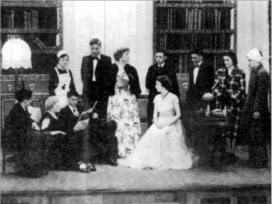
The cast of Ambrose Applejohn's Adventure, performed by the school in 1953.