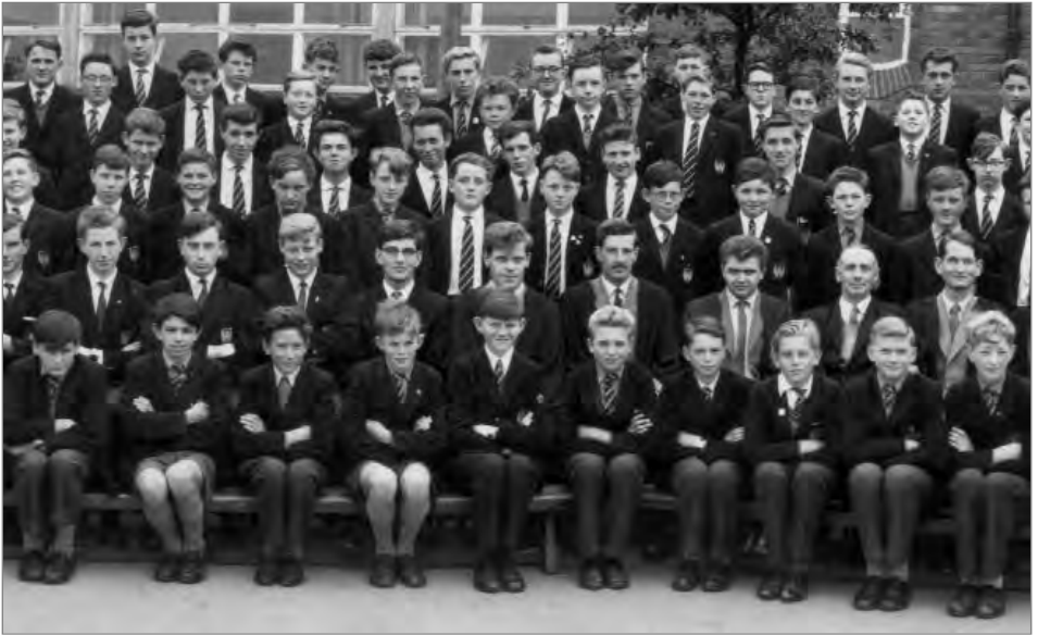
Extract from a panoramic photograph of pupils at the Boys' Grammar School, Summer 1962. The author is second from the right on the front row.