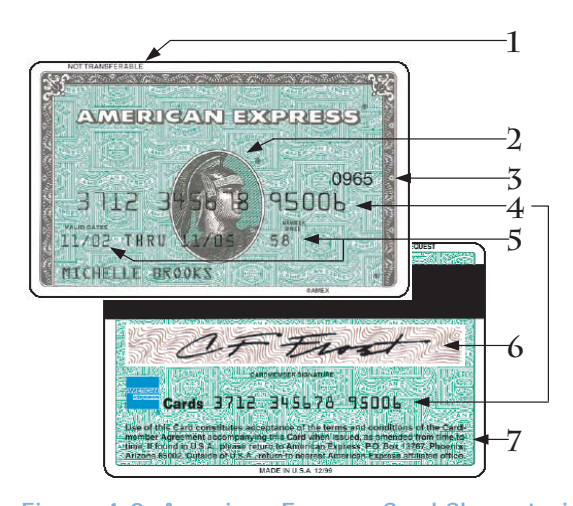
Figure 4-3: American Express Card Characteristics

Common features exist on American Express Card types.