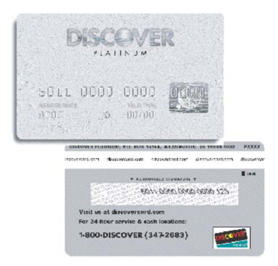
Figure 4-4: Discover Card Characteristics

Discover Cards contain the same characteristics. These include: