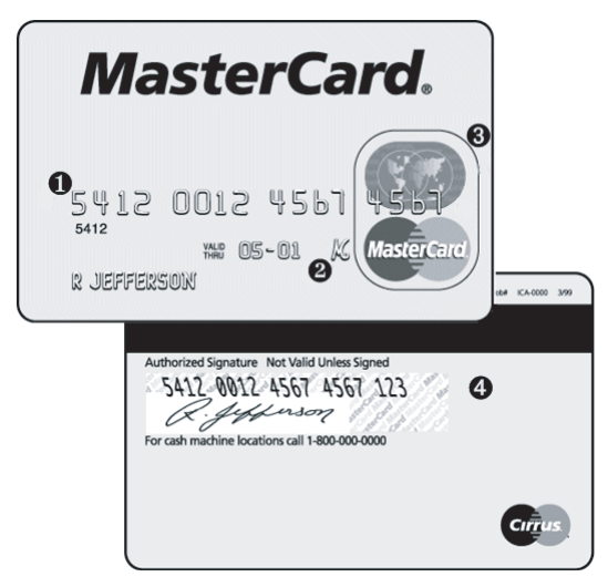
Figure 4-1: MasterCard Characteristics

MasterCard uses the same basic design elements on nearly all of their Card types.