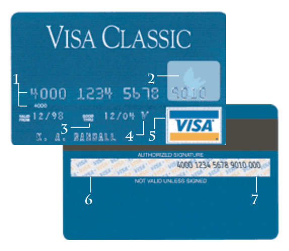
Figure 4-2: Visa Card Characteristics

Visa uses the same basic design elements on nearly all of their Card types.