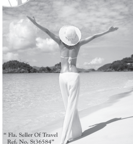
" Fla. Seller Of Travel Ref. No. St36584"

NEED A BREAK, BUT DON'T HAVE A LOT OF TIME? CHECK OUT THESE AMAZING PROMOTIONS ON SHORT GETAWAYS FROM ROYAL CARIBBEAN INTERNATIONAL!