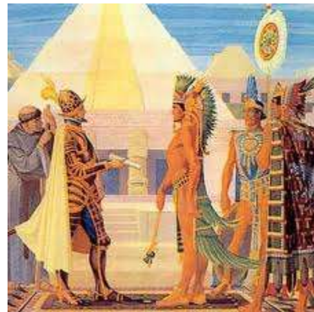
"Aztec - Google Search." Aztec - Google Search . N.p., n.d. Web. 18 June 2014.

Question: How could disease cause an empire to decline?