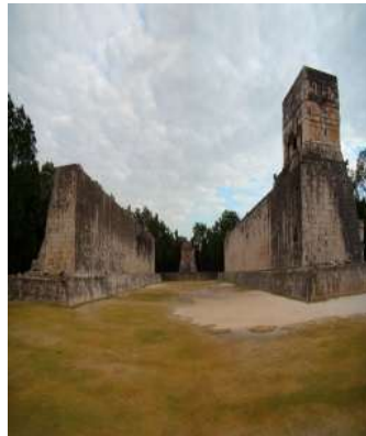
Aztecs, Maya, and Inca." History for Kids . N.p., n.d. Web. 16 June 2014.

Question: What type of architectural structure was found in both Mesoamerica and the eastern hemisphere?