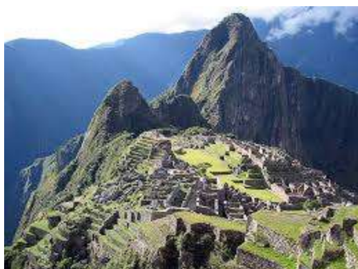
"Classic Inca Trail, The Most Famous of Peru Hiking Adventures." Classic Inca Trail, The Most Famous of Peru Hiking Adventures . N.p., n.d. Web. 18 June 2014.