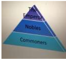
"Inca Government - Google Search." Inca Government - Google Search . N.p., n.d. Web. 18 June 2014.

The Incas ruled by proxy . The Incas had a very strong emperor who allowed local leaders to remain in power. The social structure of the Incas was not flexible. At the top of the social structure was the emperor who had absolute power. Next, was the royal family who were the nobles (the highest class in certain societies, especially those holding hereditary titles or offices). Each tribe had a tribal head; each clan in each tribe had a clan head. At the bottom of the social triangle were the common people. Each group cooperated with the other yet there was not opportunity to advance in society.