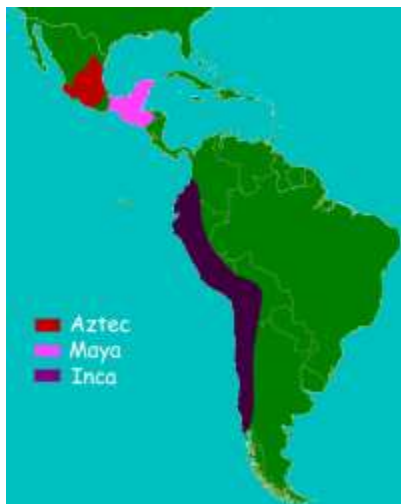
"Aztecs, Maya, and Inca." History for Kids . N.p., n.d. Web. 16 June 2014.

For more than 1100 years three separate, but similar civilizations flourished in Central and South America. These civilizations were the Mayans , Aztec , and Incas . Farming led to the growth of these civilizations. Growing corn and other crops created a change from hunter-gatherer societies to more complex, settled societies. All three civilizations were geographically isolated and left little culture behind, they were all advanced civilizations.