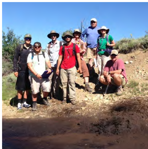
Week 6 of Field Camp in Rock Springs, WY