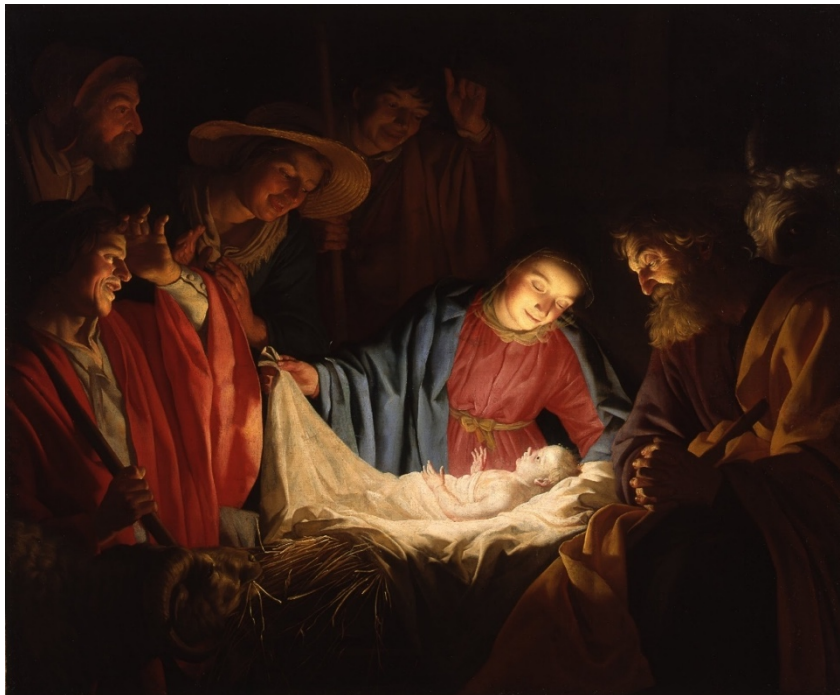
Adoration of the Shepherds (1622) Gerard van Honthorst (1592-1656)

All of our worship is currently conducted on Zoom; please visit www.overbrookpresb.org for links and information.